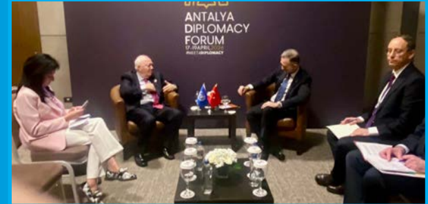
H.E. Z. Levent Gümrükçü , Deputy Minister of Foreign Affairs, Republic of Türkiye

On the sidelines of the Antalya Diplomacy Forum, the High Representative held a spate of high-level meetings, including: