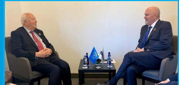
H.E. Mr. Feridun H. Sinirlioğlu , Secretary General, Organization for Security and Co-Operation In Europe (OSCE)