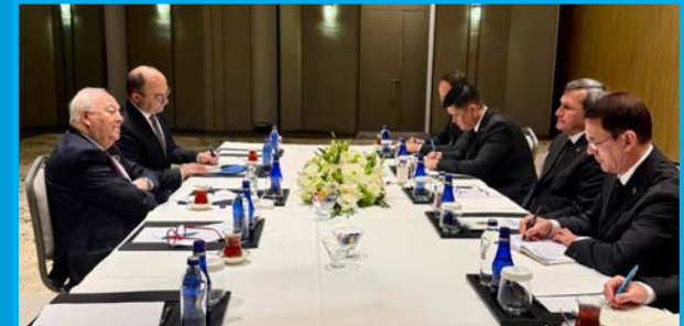
H.E. Mr. Rashid Meredov , Deputy Chairman of the Cabinet of Ministers and Minister Of Foreign Affairs, Turkmenistan