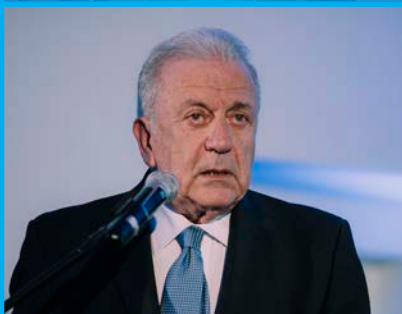
H.E. Mr. Dimitris Avramopoulos, European Commissioner for Migration, Home Affairs & Citizenship (2014–2019)