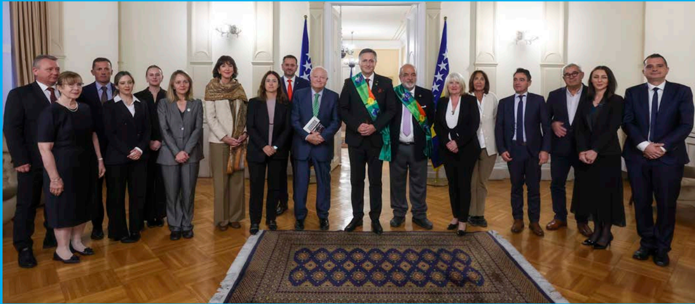
On the margin of the second chapter of the initiative “A Call for Peace, the End of Wars and Respect for International Law”, Mr. Miguel Ángel Moratinos , met with H.E. Denis Bećirović , Chairman of the Presidency of Bosnia and Herzegovina, during an event held to present the Mediterranean Award – Special Edition “Memoriae” to the country, conferred by the Fondazione Mediterraneo. (16 October)