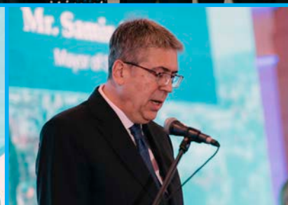
Mr. Samir Avdić, Mayor of Sarajevo