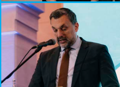
H.E. Mr. Elmedin Konaković, Minister of Foreign Affairs of Bosnia and Herzegovina