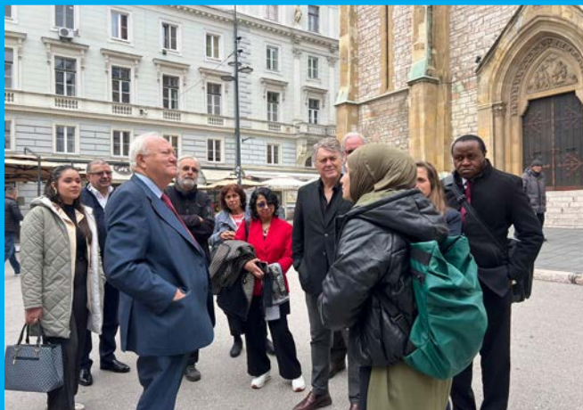
The High Representative joined the “Visit Sarajevo Walking Tour” to experience Sarajevo’s vibrant history and rich intercultural and interreligious heritage. (17 October)