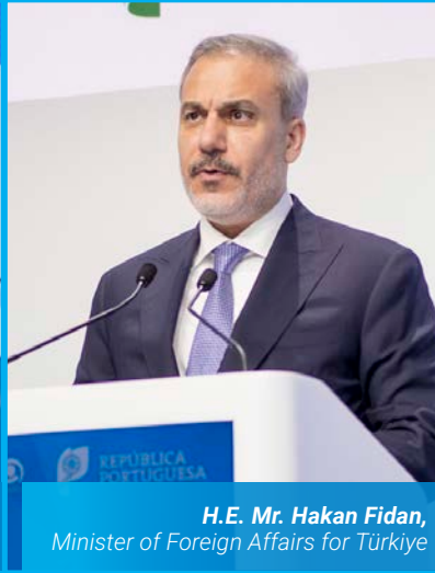
H.E. Mr. Hakan Fidan, Minister of Foreign Affairs for Türkiye