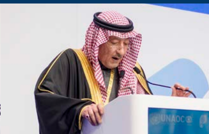
H.E. Mr. Waleed Abdulkarim El Khareiji , Deputy Minister for Foreign Affairs of the Kingdom of Saudi Arabia