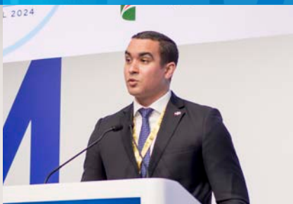
H.E. Mr. José Julio Gómez, Deputy Minister of Bilateral Foreign Policy of the Ministry of Foreign Affairs of the Dominican Republic