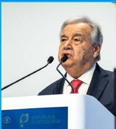
H.E. Mr. António Guterres, United Nations Secretary-General