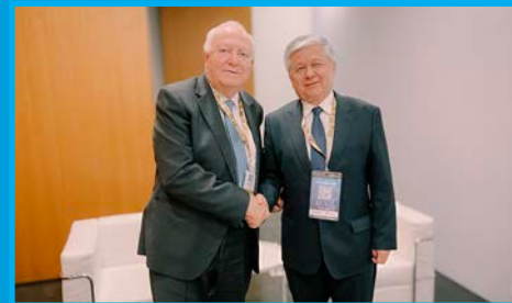
H.E. Mr. Bakhromjon Aloyev , First Deputy Foreign Minister of Uzbekistan