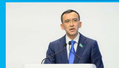
SPECIAL ADDRESS: H.E. Mr. Maulen Ashimbayev , Chairman of the Senate of the Parliament of the Republic of Kazakhstan and Head of the Secretariat of the Congress of Leaders of World and Traditional Religions, delivered a Special Address.

Following the screening of the video, the “In Memoriam” segment featured tributes from H.E. Mr. Marcelo Rebelo de Sousa , President of Portugal; H.E. Mr. José Maria Pereira Neves , President of Cabo Verde; and H.E. Mr. Nassir Abdulaziz Al-Nasser , Former High Representative of UNAOC and President of the 66th Session of the United Nations General Assembly.