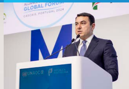
H.E. Mr. Adil Karimli , Minister of Culture of the Republic of Azerbaijan