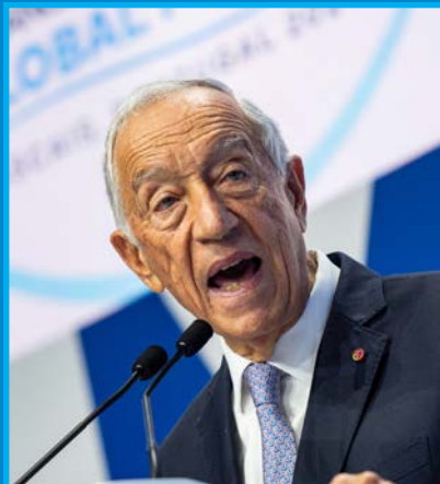
H.E. Mr. Marcelo Rebelo de Sousa, President of Portugal