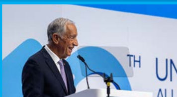
H.E. Mr. Marcelo Rebelo de Sousa, President of Portugal