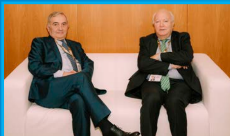
H.E. Amb. Lazar Comanescu , Secretary General of the Organization of the Black Sea Economic Cooperation (BSEC)