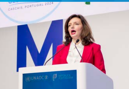
H.E. Ms. Mariana Betsa , Deputy Minister for Foreign Affairs of Ukraine