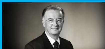
In Memoriam: The late President Jorge Sampaio of Portugal; first High Representative for UNAOC