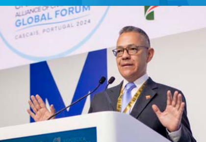
H.E. Mr. Ernesto Emilio Villegas Poljak , Minister of the People's Power for Culture of the Bolivarian Republic of Venezuela