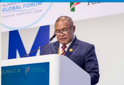
H.E. Mr. Bendito dos Santos Freitas , Minister for Foreign Affairs and Cooperation of the Democratic Republic of Timor-Leste