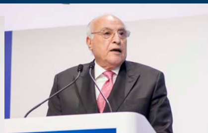
H.E. Mr. Ahmed Attaf , Minister of State, Minister of Foreign Affairs, National Community Abroad and African Affairs of Algeria