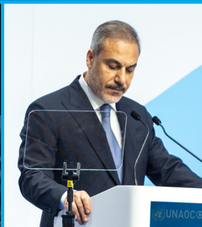
H.E. Mr. Hakan Fidan, Minister for Foreign Affairs of Türkiye