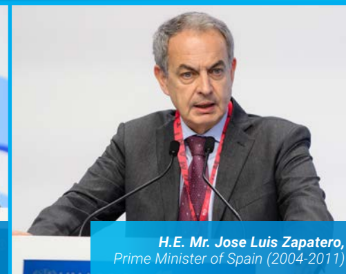
H.E. Mr. Jose Luis Zapatero, Prime Minister of Spain (2004-2011)

In a segment entitled “ Special Reflections: Two Decades of Dialogue for Humanity ”, distinguished speakers shared profound insights on the Alliance’s two decades of dialogue and the urgent need to forge a path for peace for One Humanity.