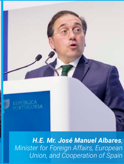
H.E. Mr. José Manuel Albares, Minister for Foreign Affairs, European Union, and Cooperation of Spain