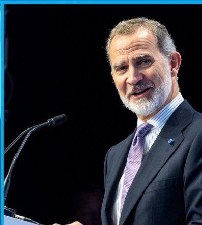
His Majesty King Felipe VI of Spain, King of Spain