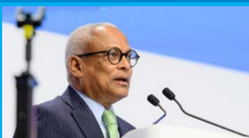
H.E. Mr. José Maria Pereira Neves, President of Cabo Verde