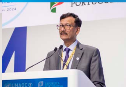
H.E. Md. Touhid Hossain , Adviser for Foreign Affairs to the Interim Government of Bangladesh