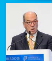
Mr. Carlos Carreiras , Mayor of Cascais, Portugal, welcomed participants of the 10th UNAOC Global Forum to Cascais.