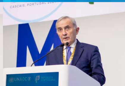
H.E. Mr. Lazăr Comănescu, Secretary General of the Organization of the Black Sea Economic Cooperation (BSEC)