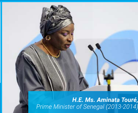
H.E. Ms. Aminata Touré, Prime Minister of Senegal (2013-2014)