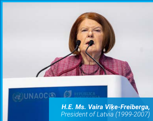
H.E. Ms. Vaira Vīķe-Freiberga, President of Latvia (1999-2007)