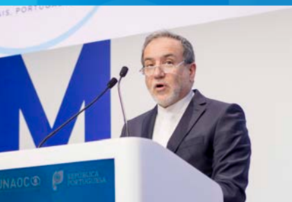
H.E. Dr. Seyed Abbas Araghchi , Minister for Foreign Affairs of the Islamic Republic of Iran