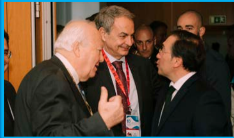
H.E. Mr. José Manuel Albares , Spanish Minister of Foreign Affairs, European Union and Cooperation