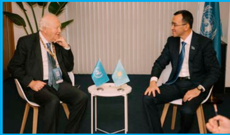
H.E. Mr. Maulen Ashimbayev , Chairman of the Senate of the Parliament of the Republic of Kazakhstan

The High Representative also signed Memorandums of Understanding to strengthen collaboration with: