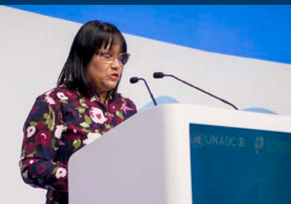
H.E. Ms. Anayansi Rodriguez Camejo, Vice-Minister for Foreign Affairs of the Republic of Cuba