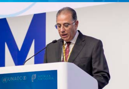
H.E. Mr. Nabil Riad Habashi, Deputy Minister for Foreign Affairs, Emigration and Egyptian Expatriates of the Arab Republic of Egypt