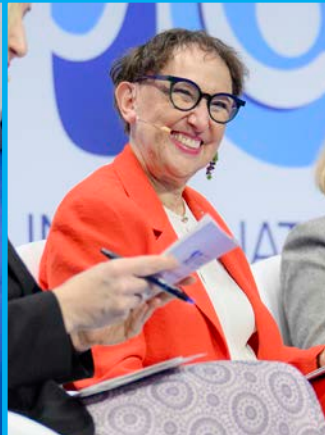
H.E. Ms. Rebeca Grynspan , Secretary-General of the United Nations Conference on Trade and Development