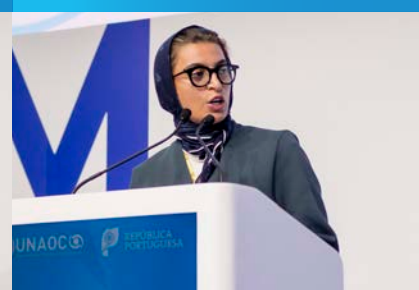
H.E. Ms. Noura bint Mohammed Al Kaabi , Minister of State, Ministry of Foreign Affairs of the United Arab Emirates