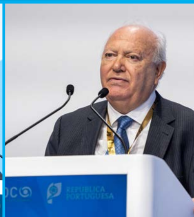
H.E. Mr. Miguel Ángel Moratinos, USG, High Representative for UNAOC

The Official Opening Ceremony of the 10th UNAOC Global Forum set a powerful tone for the three-day gathering, celebrating two decades of fostering dialogue, trust, and unity for #OneHumanity.