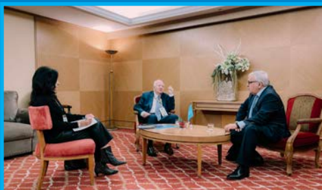
H.E. Mr. Sergey Vershinin , Deputy Minister of Foreign Affairs of the Russian Federation