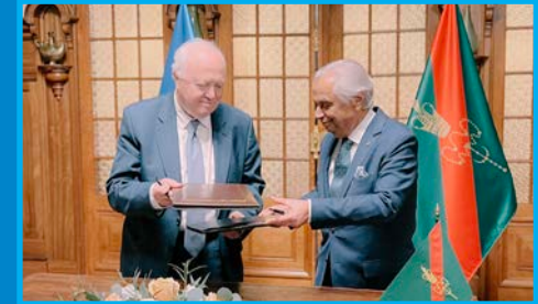
H.E. Nazim Ahmad , Diplomatic Representative of the Ismaili Imamat to Portugal