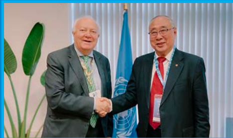
H.E. Mr. Wu Hongbo , Special Representative of the Chinese Government on European Affairs