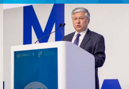
H.E. Mr. Bakhromjon Alov , First Deputy Minister for Foreign Affairs of the Republic of Uzbekistan