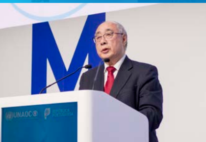
H.E. Mr. Hongbo Wu, Special Representative of Chinese Government on European Affairs