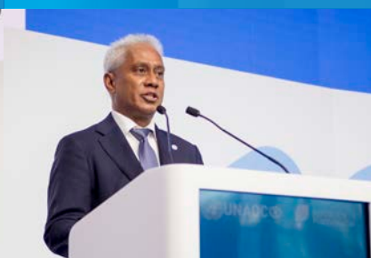
H.E. Mr. Zacarias da Costa, Executive Secretary of the Comunidade dos Países de Língua Portuguesa (CPLP)