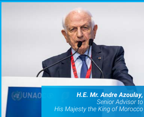
H.E. Mr. Andre Azoulay, Senior Advisor to His Majesty the King of Morocco