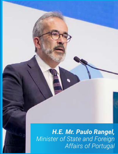
H.E. Mr. Paulo Rangel, Minister of State and Foreign Affairs of Portugal