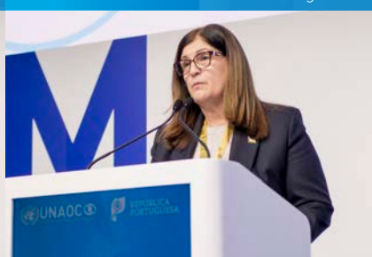
H.E. Dr. Varsen Aghabekian , Minister of State for Foreign Affairs and Expatriates of the State of Palestine