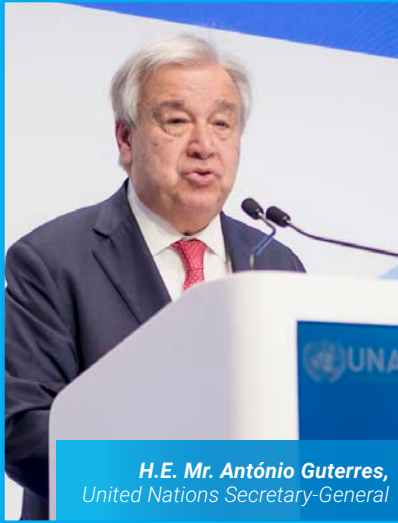
H.E. Mr. António Guterres, United Nations Secretary-General