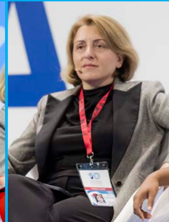
H.E. Ms. Eka Tkeshelashvili , Deputy Prime Minister of Georgia (2010-2012)