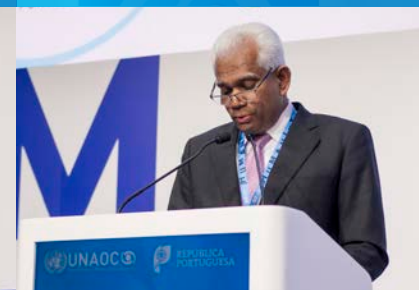
H.E. Dato' Bala Chandran Tharman, Deputy Secretary General for Multilateral Affairs of the Ministry of Foreign Affairs of Malaysia