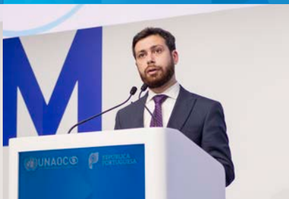
H.E. Mr. Vahan Kostanyan , Deputy Minister for Foreign Affairs of the Republic of Armenia