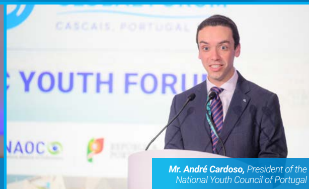
Mr. André Cardoso , President of the National Youth Council of Portugal

The UNAOC Youth Forum kicked off the 10th UNAOC Global Forum, bringing together over 100 young leaders from more than 70 countries at the historic Forte de São Julião da Barra in Portugal. Against this iconic backdrop, youth alumni of UNAOC's flagship programmes championed messages of peace and solidarity, setting the tone for the days ahead.