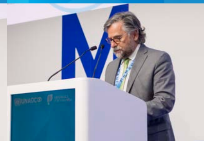
Hon. António Pedro Roque Da Visitação Oliveira, Vice-President of the Parliamentary Assembly of the Mediterranean (PAM)