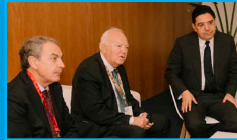
H.E. Mr. José Luis Rodríguez Zapatero , Former Prime Minister of Spain, and H.E. Mr. Nasser Bourita , Minister of Foreign Affairs of Morocco