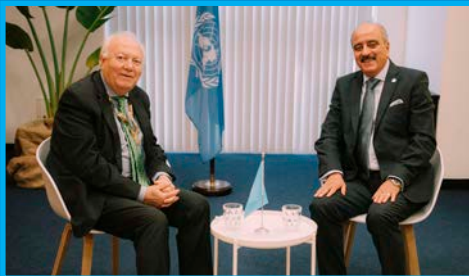
H.E. Mr. Mohamed Ali Nafti , Minister of Foreign Affairs, Migration and Tunisians Abroad