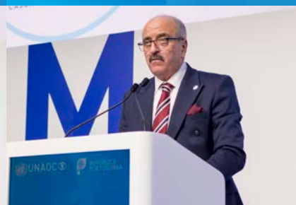
H.E. Mr. Mohamed Ali Nafti , Minister for Foreign Affairs, Migration and Tunisians Abroad of the Republic of Tunisia