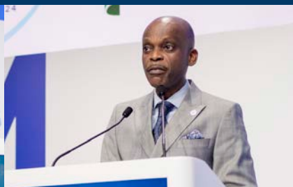
H.E. Mr. Robert Dussey , Minister for Foreign Affairs, Regional Integration and Togolese Abroad of the Togolese Republic