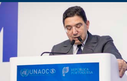
H.E. Mr. Nasser Bourita , Minister for Foreign Affairs, African Cooperation and Moroccan Expatriates of the Kingdom of Morocco