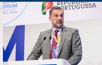
H.E. Mr. Elmedin Konaković , Minister for Foreign Affairs of Bosnia and Herzegovina