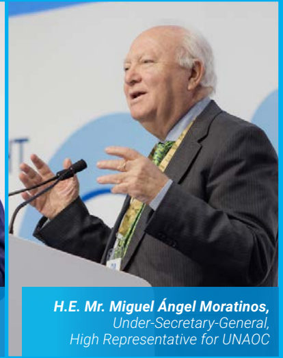
H.E. Mr. Miguel Ángel Moratinos, Under-Secretary-General, High Representative for UNAOC

The 10th UNAOC Global Forum convened 118 official delegations in Cascais, Portugal, for a High-level Ministerial Meeting of the UNAOC Group of Friends . The gathering brought together Ministers, Deputy Ministers, Heads of International Organizations, and delegations representing the UNAOC Group of Friends.