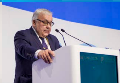
H.E. Mr. Sergey Vershinin , Deputy Minister for Foreign Affairs of the Russian Federation