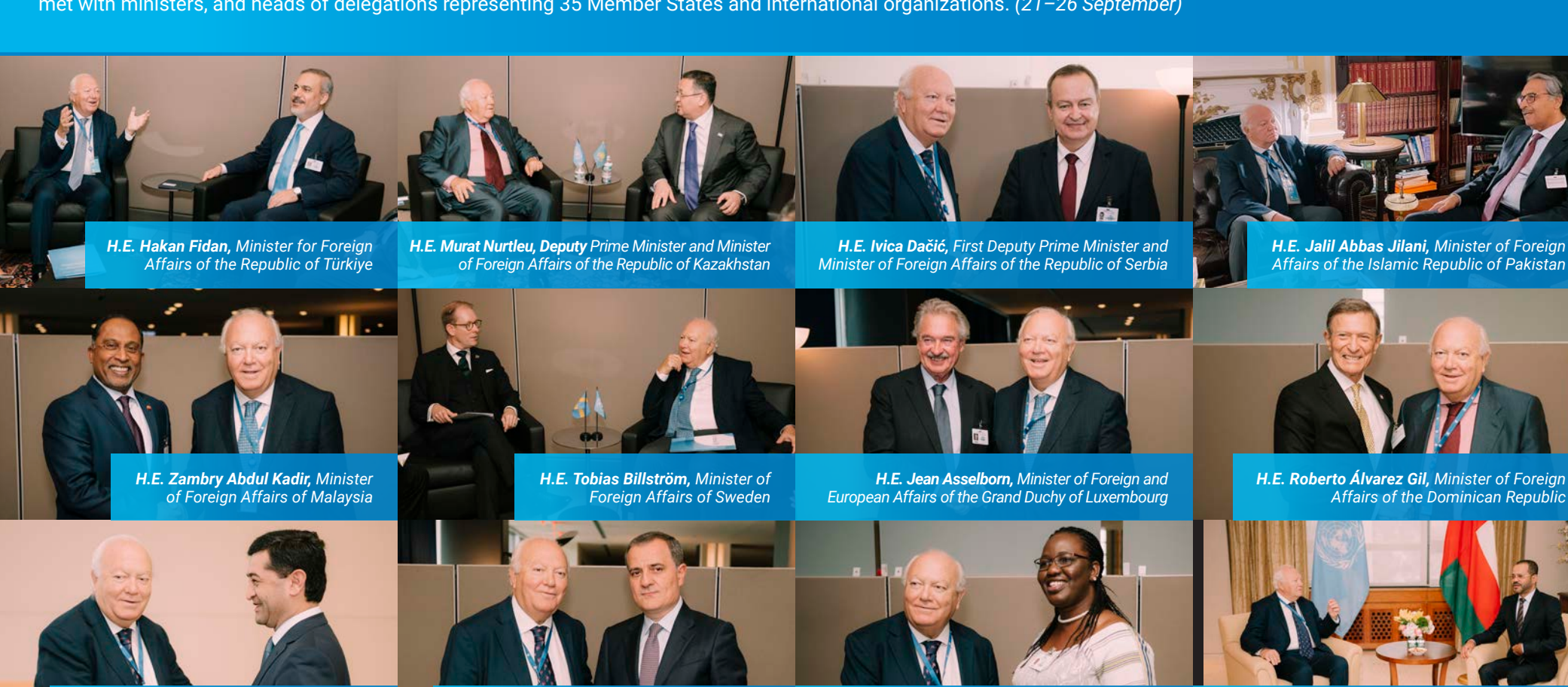
H.E. Bakhtiyor Saidov, Minister of Foreign Affairs of the Republic of Uzbekistan

On the sidelines of the 78th session of the United Nations General Assembly (UNGA), the Under-Secretary-General, H.E. Mr. Miguel Ángel Moratinos, convened a spate of bilateral meetings to further collaboration to achieve common goals and interests. Topics of discussion included boosting confidence-building measures for durable peace; promoting intercultural, intercivilizational and interreligious dialogue; preventing polarization and radicalization; strengthening the role of women, youth and traditional religious leaders in peacebuilding efforts; and, advancing tolerance, trust, harmony and respect for diversity. Demonstrating UNAOC's commitment to dialogue, Mr. Moratinos met with ministers, and heads of delegations representing 35 Member States and international organizations. (21-26 September)