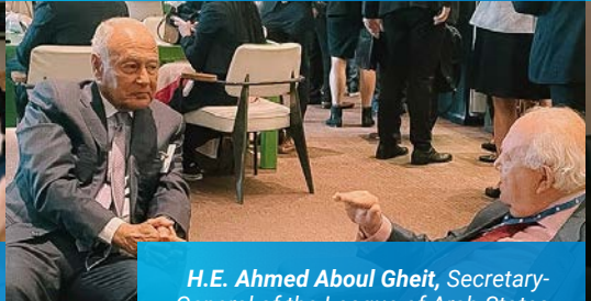
General of the League of Arab States