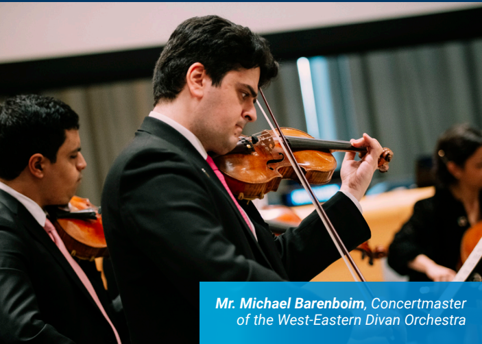
Mr. Michael Barenboim, Concertmaster of the West-Eastern Divan Orchestra