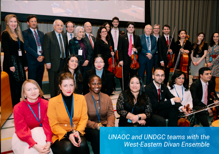
UNAOC and UNDGC teams with the West-Eastern Divan Ensemble