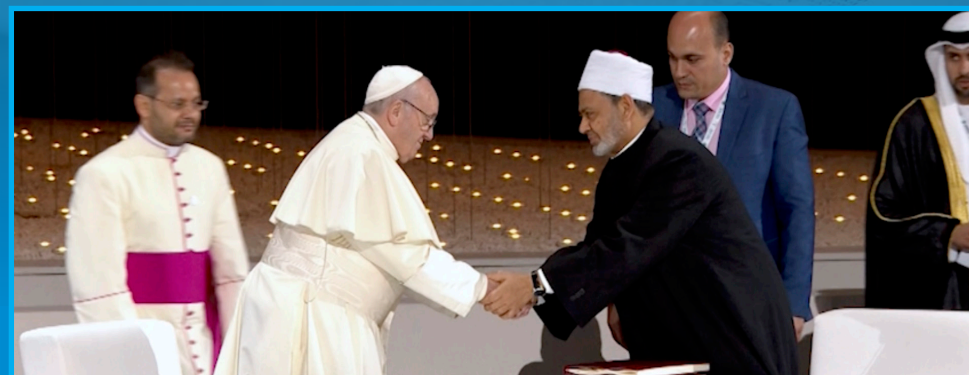
The UN General Assembly Resolution A/RES/75/200 , which declared Feb 4 as the International Day of Human Fraternity, takes note of the meeting between His Holiness Pope Francis and His Eminence the Grand Imam of Al-Azhar, Ahmad al-Tayeb on 4 February 2019 in Abu Dhabi, UAE that resulted in the signing of the “Document on Human Fraternity for World Peace and living Together”.