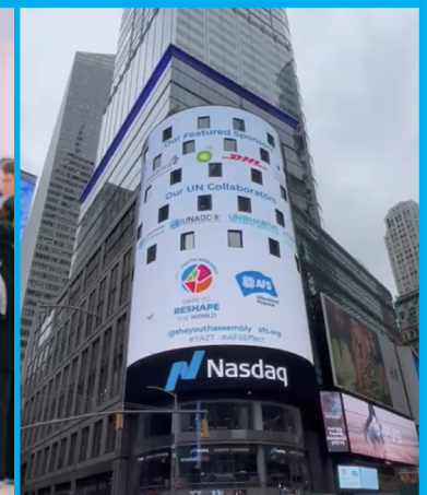
Ahead of the Youth Assembly, the UNAOC logo was displayed in Times Square along with other partners