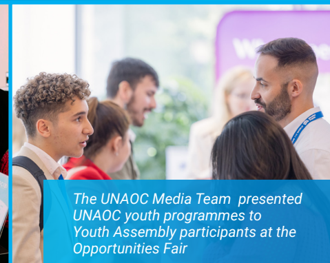
The UNAOC Media Team presented UNAOC youth programmes to Youth Assembly participants at the Opportunities Fair