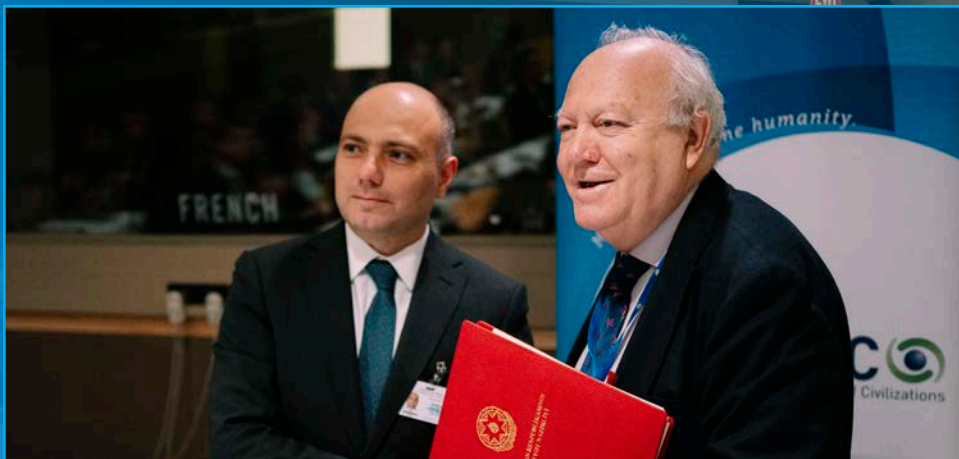
USG Mr. Moratinos and H.E. Mr. Anar Karimov, Minister of Culture of the Republic of Azerbaijan, after jointly signing the #Peace4Culture Action Plan