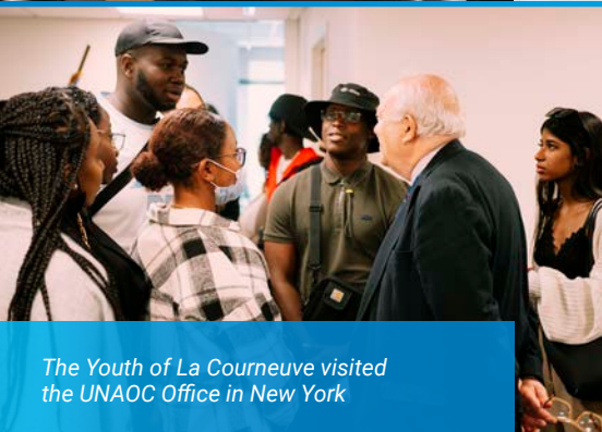
The Youth of La Courneuve visited the UNAOC Office in New York