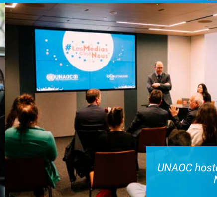
UNAOC hosted the screening of the documentary of "Les Medias C'est Nous", featuring testimonies of the Youth of La Courneuve