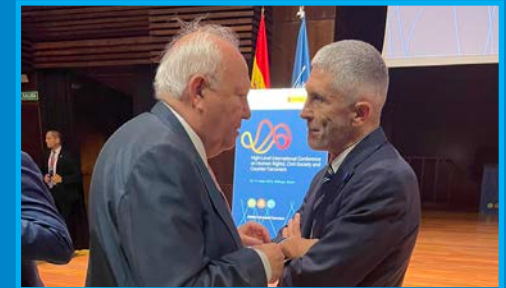
Mr. Moratinos with H.E. Mr. Fernando Grande-Marlaska, Minister of Interior of Spain

In a side-event co-organized by UNOCT , the Mission of the State of Qatar and Beyond Conflict entitled “ Fostering Resiliency through a Behavioral Insights Approach ”, Mr. Moratinos discussed how ethics and human rights-based approaches in prevention programmes have a positive impact on beneficiaries’ resilience to terrorism. (9-11 May)