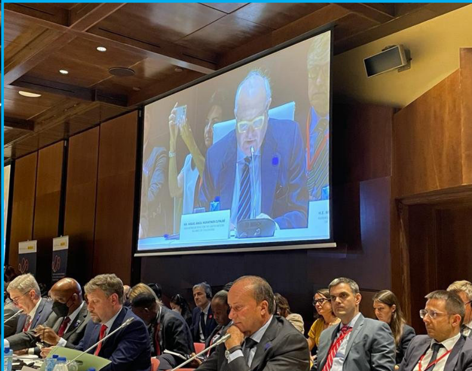
USG Mr. Moratinos addressing the High-Level International Conference in Málaga

The High Representative for UNAOC, Mr. Miguel Angel Moratinos, addressed the Plenary Session of the High-Level International Conference on Human Rights, Civil Society and Counter-Terrorism: “For a Future Free from Terrorism: Building Resilience with Civil Society through the Rule of Law and Human Rights” , co-organized by the United Nations Office of Counter-Terrorism (UNOCT) and the Ministry of Foreign Affairs of Spain , in Malaga, Spain.