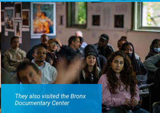
They also visited the Bronx Documentary Center