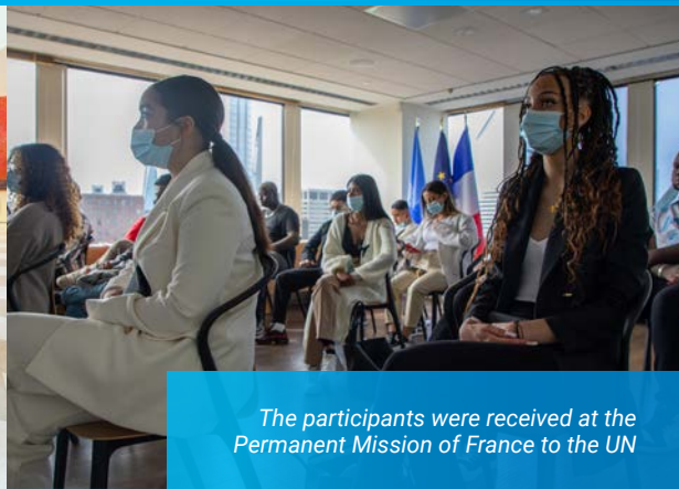
The participants were received at the Permanent Mission of France to the UN