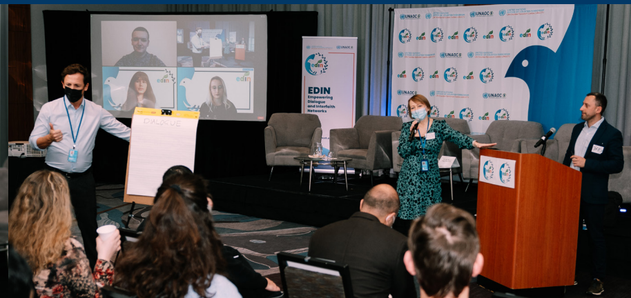
The UNAOC team briefed EDIN participants at the onset of the 2-day event