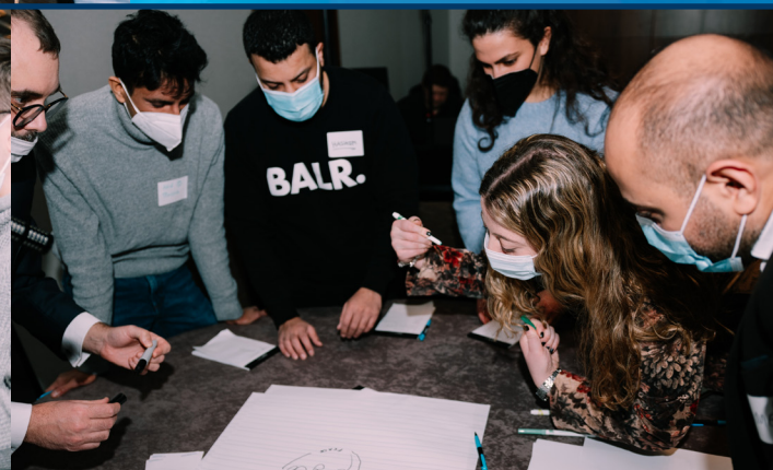
Through a series of interactive workshops, EDIN participants shared their reflections and lessons learned from their peer-to-peer capacity-building activities