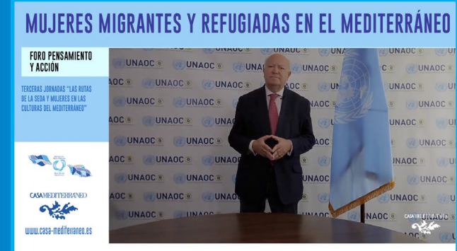
The High Representative for UNAOC, H.E. Mr. Miguel Moratinos, delivered remarks in a video message at the Casa Mediterráneo "Silk Road and Women in the Mediterranean Cultures" conference. Mr. Moratinos reiterated that women's active participation is an essential element of peace and sustainable development. "You can count on my full support to continue uplifting women in the many challenges they face, with the belief that their active participation in all societies of the world is essential for peace and sustainable development", he said. (3 November)