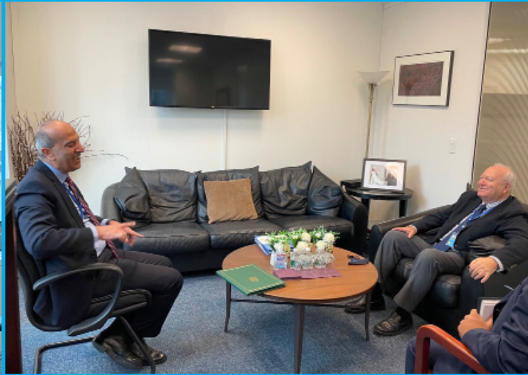
Mr. Moratinos received the Permanent Representative of the Arab Republic of Egypt to the United Nations, H.E. Mr. Osama Mahmoud Abdelkhalek. They discussed mutual collaboration between Egypt and UNAOC. Mr. Abdelkhalek renewed Egypt's commitment to support UNAOC's work. (29 November)