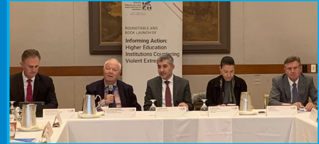
Mr. Moratinos participated in the Hamad Bin Khalifa University Roundtable and Book Launch of "Informing Action: Higher Education Institutions Countering Violent Extremism". In his remarks, the High Representative reiterated UNAOC's commitment to achieving the goals of global education and emphasized that PVE strategies should make use of all venues that provide youth with learning opportunities. "Racism, xenophobia and discrimination have been exacerbated by the pandemic. Violent extremists across the ideological spectrum view the crisis as an opportunity for expansion," he said. (1 November)