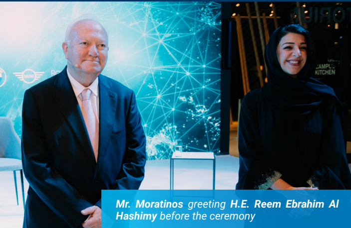
Mr. Moratinos greeting H.E. Reem Ebrahim Al Hashimy before the ceremony