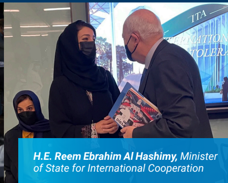
H.E. Reem Ebrahim Al Hashimy, Minister of State for International Cooperation