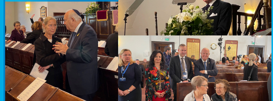
“A celebration of Jewish Life in Sweden” at the Malmö Synagogue

Mr. Moratinos participated in a breakout session on Combating Antisemitism and Social Media . In his remarks, the High Representative spoke about social media being a part of the problem and the solution on combating hate speech, antisemitism and other forms of racism. He emphasized the importance of the use of social media as a positive transmitter of counternarratives. “ Big Tech organizations need to invest more resources and establish more safeguards against hate speech. We have to develop critical thinking skills of young people to enable them to identify hate content and misinformation online and offline, ” he said.