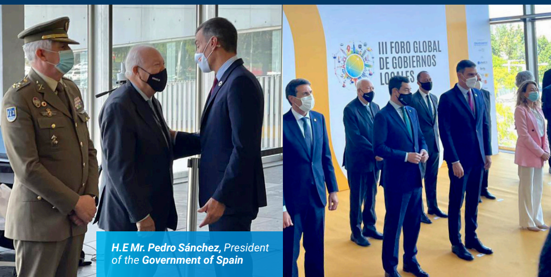
H.E. Mr. Pedro Sánchez, President of the Government of Spain