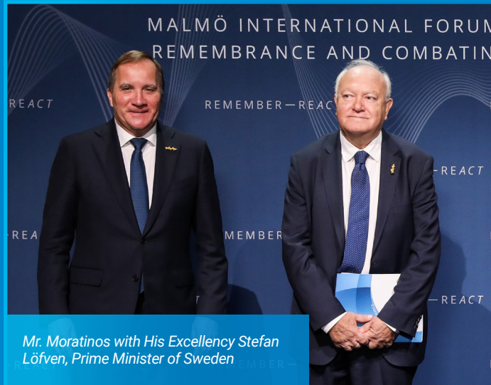
Mr. Moratinos with His Excellency Stefan Löfven, Prime Minister of Sweden

To kick off the Malmö International Forum on Holocaust Remembrance and Combating Antisemitism , the High Representative for the United Nations Alliance of Civilizations, Mr. Miguel Ángel Moratinos, engaged in a meet and greet with His Excellency Stefan Löfven, Prime Minister of Sweden.