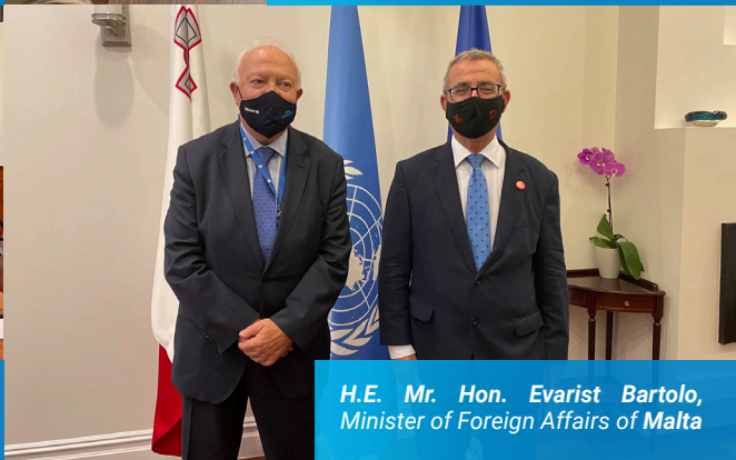
H.E. Mr. Hon. Evarist Bartolo, Minister of Foreign Affairs of Malta