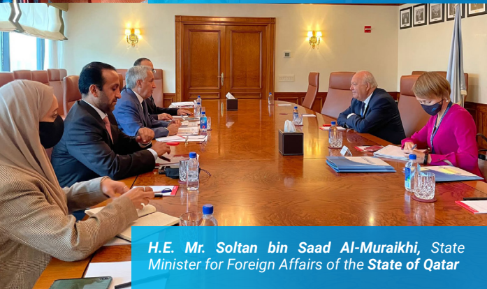
H.E. Mr. Soltan bin Saad Al-Muraikhi, State Minister for Foreign Affairs of the State of Qatar