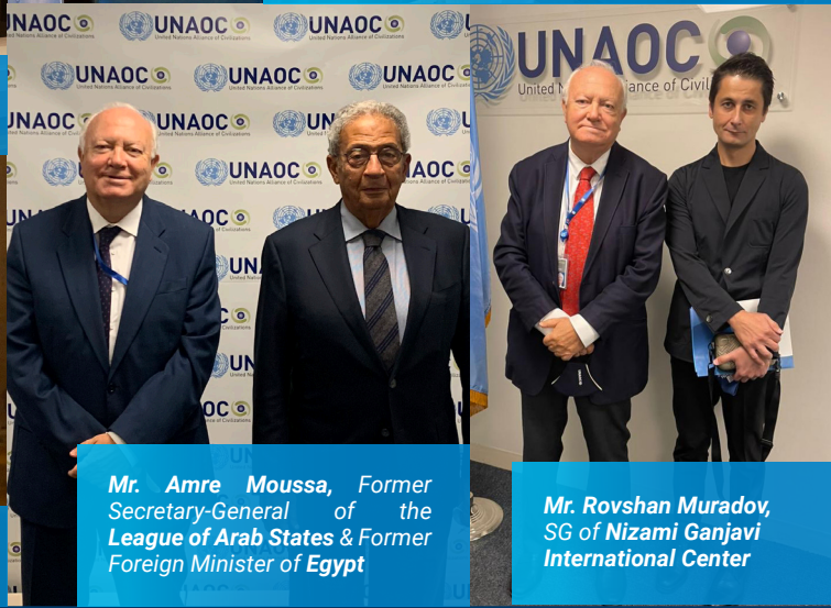
Mr. Amre Moussa, Former Secretary-General of the League of Arab States and Former Foreign Minister of Egypt