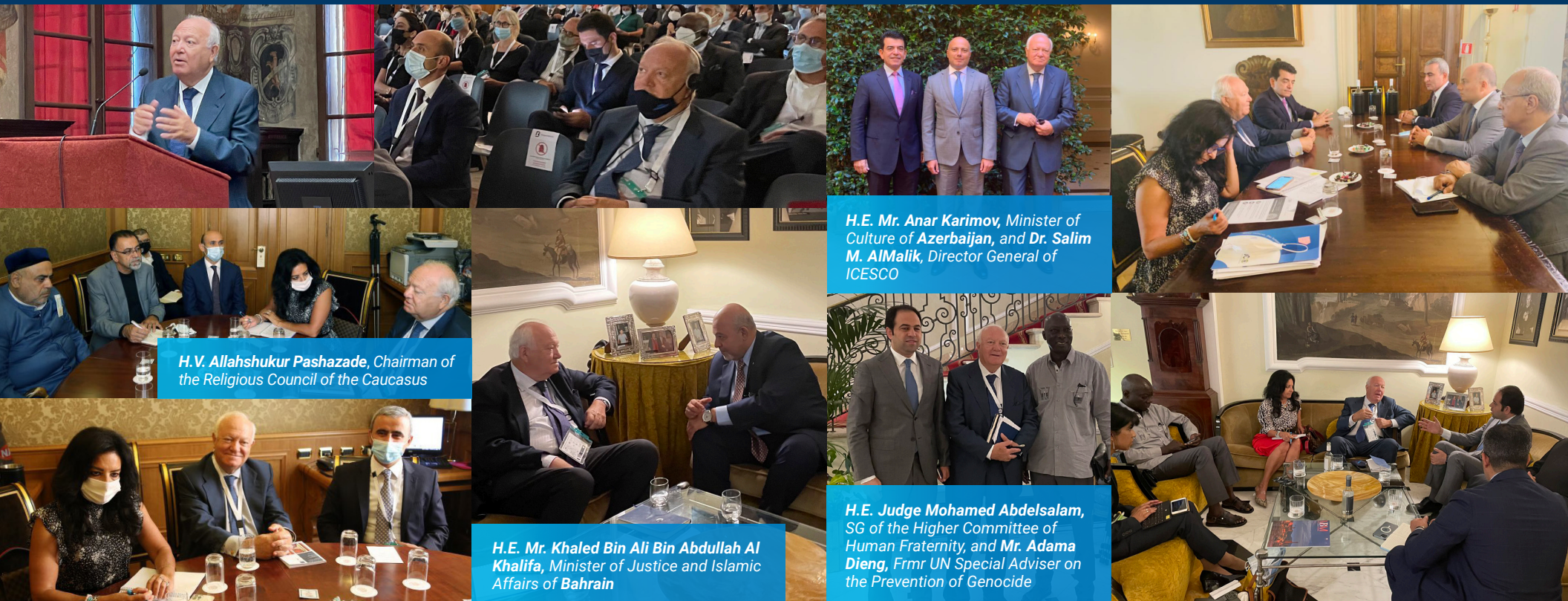
H.V. Allahshukur Pashazade, Chairman of the Religious Council of the Caucasus