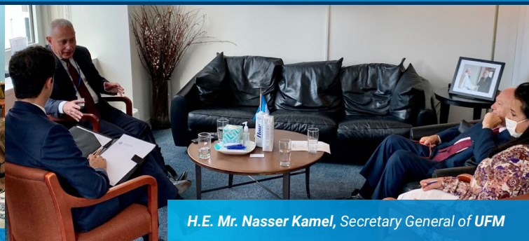
H.E. Mr. Nasser Kamel, Secretary General of UFM