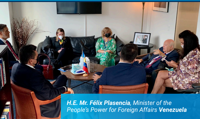
H.E. Mr. Félix Plasencia, Minister of the People's Power for Foreign Affairs Venezuela

The High Representative for UNAOC held a series of bilateral meetings to discuss UNAOC avenues of collaboration and future projects and activities, including with the Ministers of Foreign Affairs of Spain, Turkey, Venezuela, Portugal, Qatar, Malta, Armenia and Serbia . Mr. Moratinos also met with H.E. Abdullah Al-Mouallimi, Permanent Representative of the Kingdom of Saudi Arabia to the UN ; Mr. Amre Moussa, Former Secretary General of the Arab League and Former Foreign Minister of Egypt ; Ambassador Nasser Kamel, Secretary General of the Union for the Mediterranean (UFM) ; and Mr. Rovshan Muradov, Secretary-General of the Nizami Ganjavi International Center , to discuss the work of UNAOC in promoting intercultural and interreligious dialogue globally. (20-30 September)