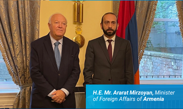
H.E. Mr. Ararat Mirzoyan, Minister of Foreign Affairs of Armenia