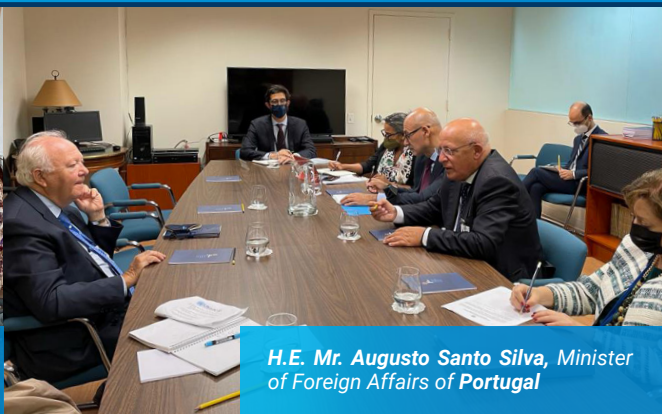
H.E. Mr. Augusto Santo Silva, Minister of Foreign Affairs of Portugal