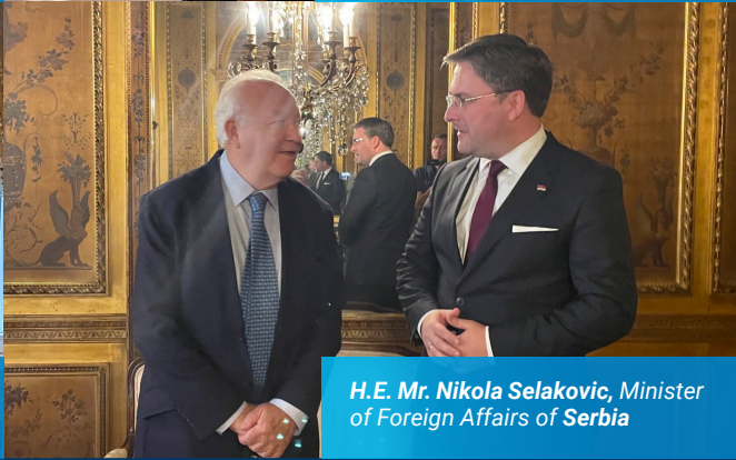
H.E. Mr. Nikola Selakovic, Minister of Foreign Affairs of Serbia