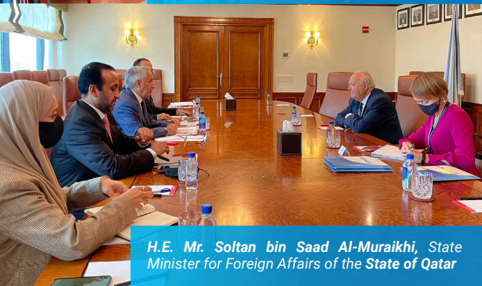
H.E. Mr. Soltan bin Saad Al-Muraikhi, State Minister for Foreign Affairs of the State of Qatar