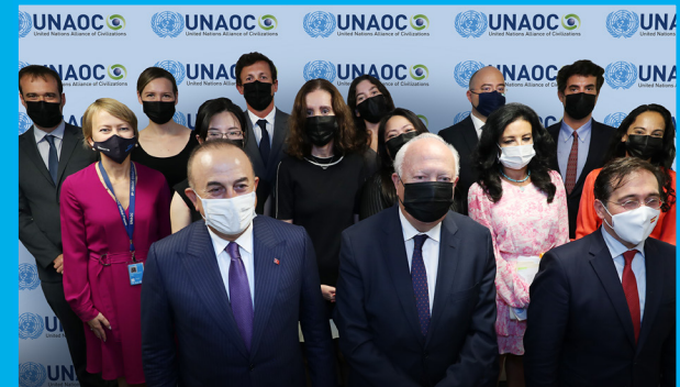
The Foreign Ministers of Spain and Turkey seized the opportunity to meet with UNAOC staff. The co-sponsors reiterated their continued support for UNAOC and the High Representative's initiatives.

The meeting took place in the office of UNAOC in New York. The trilateral meeting focused on the progress made in implementing the Action Plan of the High Representative for UNAOC , covering the 2019-2023 period, as well as the new initiatives and programmes launched during the past fifteen months. Preventing and Countering Violent Extremism (PCVE), advancing intercultural and interreligious dialogue and mediation in identity-based conflicts featured in the discussions. (22 September)