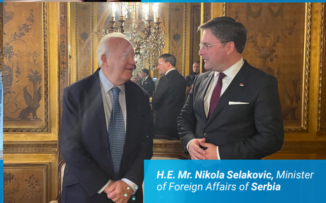
H.E. Mr. Nikola Selakovic, Minister of Foreign Affairs of Serbia