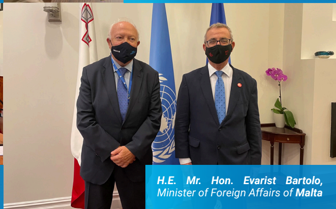
H.E. Mr. Hon. Evarist Bartolo, Minister of Foreign Affairs of Malta