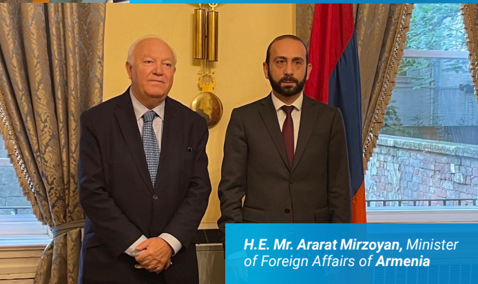
H.E. Mr. Ararat Mirzoyan, Minister of Foreign Affairs of Armenia