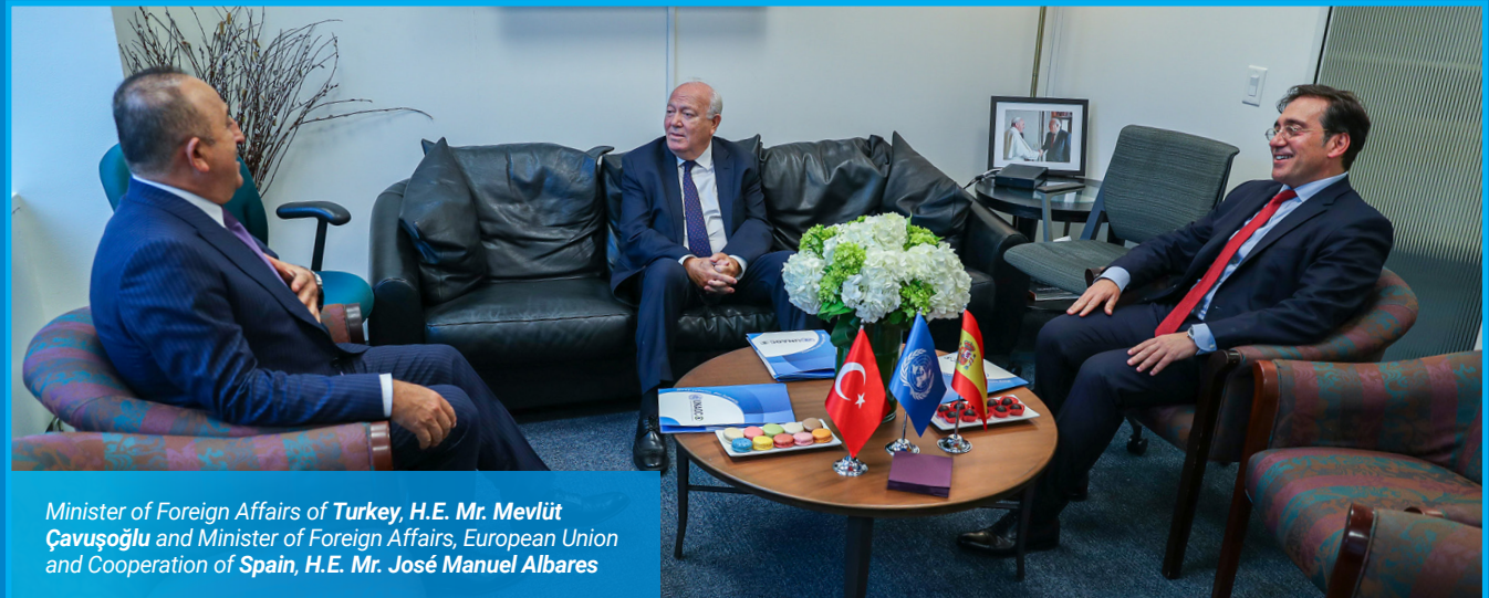
Minister of Foreign Affairs of Turkey, H.E. Mr. Mevlüt Çavuşoğlu and Minister of Foreign Affairs, European Union and Cooperation of Spain, H.E. Mr. José Manuel Albares

On the margins of the 76th session of the United Nations General Assembly, the High Representative for UNAOC received delegations of the two co-sponsors of UNAOC, namely the governments of Turkey and Spain led respectively by Turkish Foreign Minister H.E. Mr. Mevlüt Çavuşoğlu and Spanish Foreign Minister H.E. Mr. José Manuel Albares .