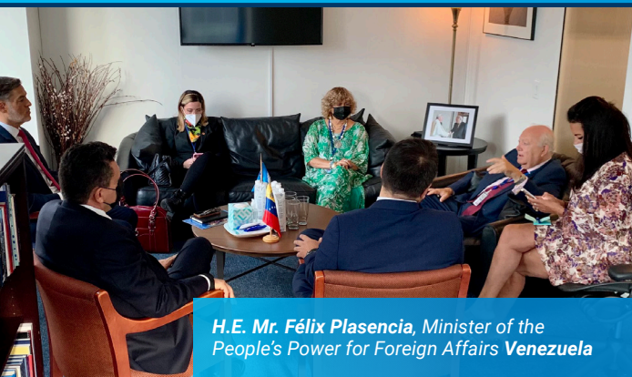
H.E. Mr. Félix Plasencia, Minister of the People's Power for Foreign Affairs Venezuela

The High Representative for UNAOC held a series of bilateral meetings to discuss UNAOC avenues of collaboration and future projects and activities, including with the Ministers of Foreign Affairs of Spain, Turkey, Venezuela, Portugal, Qatar, Malta, Armenia and Serbia . Mr. Moratinos also met with H.E. Abdullah Al-Mouallimi, Permanent Representative of the Kingdom of Saudi Arabia to the UN ; Mr. Amre Moussa, Former Secretary General of the Arab League and Former Foreign Minister of Egypt ; Ambassador Nasser Kamel, Secretary General of the Union for the Mediterranean (UFM) ; and Mr. Rovshan Muradov, Secretary-General of the Nizami Ganjavi International Center , to discuss the work of UNAOC in promoting intercultural and interreligious dialogue globally. (20-30 September)