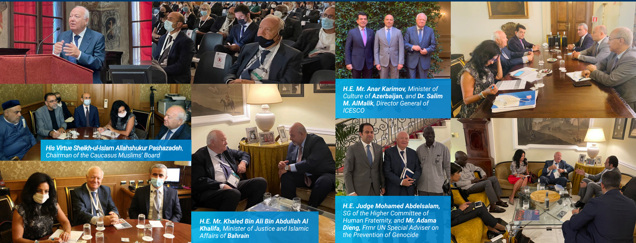
His Virtue Sheikh-ul-Islam Allahshukur Pashazadeh, Chairman of the Caucasus Muslims' Board