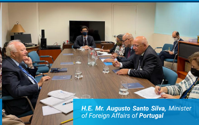
H.E. Mr. Augusto Santo Silva, Minister of Foreign Affairs of Portugal