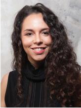
Leila Ghandi @Leila_Ghandi (moderator) TV Host, Journalist and Producer (Morocco)

Leila Ghandi is a French-Moroccan TV host, journalist, producer, author, and photographer. Jeune Afrique Magazine has ranked her among the 50 people with most influence in Morocco. Followed by a digital audience of over 600 000 people, she has produced and hosted a prime-time television show that was viewed by over two million people each month.