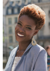
Rokhaya Diallo @RokhayaDiallo Journalist, Writer, and Filmmaker

Through her work, she promotes the representation of free Arab Muslim women, women's empowerment, and aims to build and encourage dialogue between cultures. She has been a speaker at the European Parliament and the UNESCO and is regularly invited to speak at international conferences held by the OSCE, the Union for the Mediterranean, or the EU. She has been named opinion leader by Search for Common Grounds and has won numerous awards such as the Anna Lindh Journalist Award, the Euro-Mediterranean Woman Success Trophy, and the Chevalier des Arts et des Lettres from France. She has been chosen to represent North Africa at the exhibition Summit of the African Union in Addis Ababa.