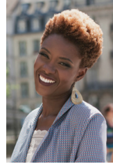
Rokhaya Diallo @RokhayaDiallo Journalist, Writer, and Filmmaker

Through her work, she promotes the representation of free Arab Muslim women, women's empowerment, and aims to build and encourage dialogue between cultures. She has been a speaker at the European Parliament and the UNESCO and is regularly invited to speak at international conferences held by the OSCE, the Union for the Mediterranean, or the EU. She has been named opinion leader by Search for Common Grounds and has won numerous awards such as the Anna Lindh Journalist Award, the Euro-Mediterranean Woman Success Trophy, and the Chevalier des Arts et des Lettres from France. She has been chosen to represent North Africa at the exhibition Summit of the African Union in Addis Ababa.