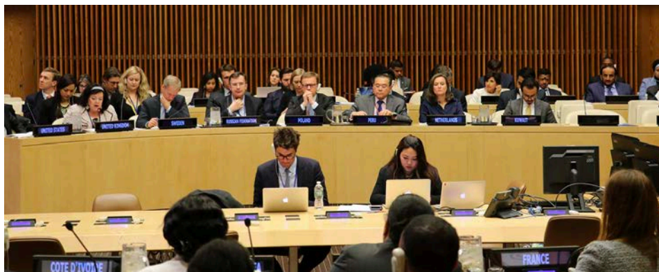
UNAOC social media team in action during the UN Security Council Arria-Formula Meeting on "Religious Leaders for a Safe World"

In 2018, UNAOC's digital outreach efforts continued to intensify, with new milestones achieved in the context of organic web traffic and social media engagement. UNAOC continues to attract a robust following to its main website, www.unaoc.org , as well as its programmes' microsites (Fellowship, PLURAL+ Youth Video Festival, etc.). Further, UNAOC has continued to amplify its digital communications campaigns to maximize the visibility of its programmes and activities to ensure maximum reach and impact. In particular, UNAOC worked actively to engage its followers by publishing a wide range of multimedia materials, including infographics, digital cards, videos, and photos.