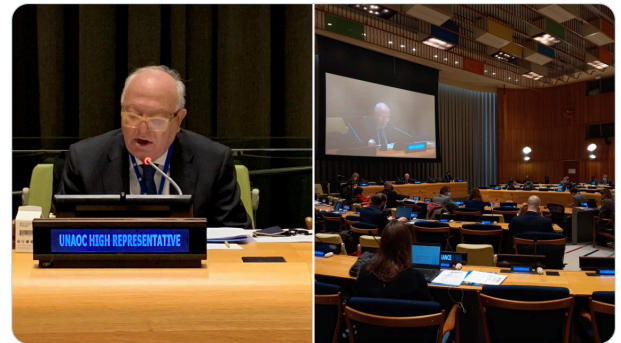
10:32 AM · Feb 8, 2022 · Twitter Web App