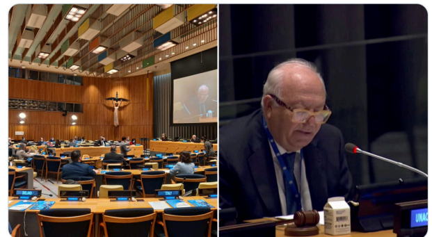
10:13 AM · Feb 8, 2022 · Twitter Web App