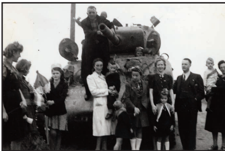
Residents of Treebeek welcome a Canadian tank who is liberating the village