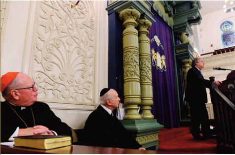
United Nations Secretary General Antonio Guterres calls for united action against anti-semitism following Pittsburgh Tree of Life Synagogue attack. Rabbi Arthur Schneier organized the United Against Hate Interfaith gathering with Cardinal Timothy Dolan and leaders of major faith communities. October 31, 2018.