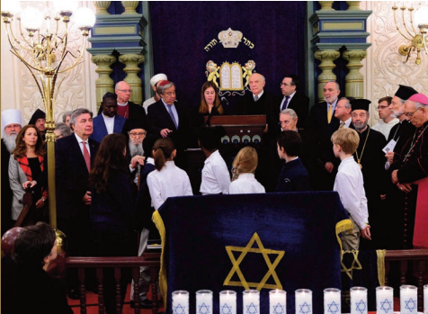
Leaders of major faith communities join the Children of the Rabbi Arthur Schneier Park East Day School on the Bimah as they light 11 memorial candles in memory of the victims and sing the prayer for Peace "Oseh Shalom", Wednesday, October 31, 2018.