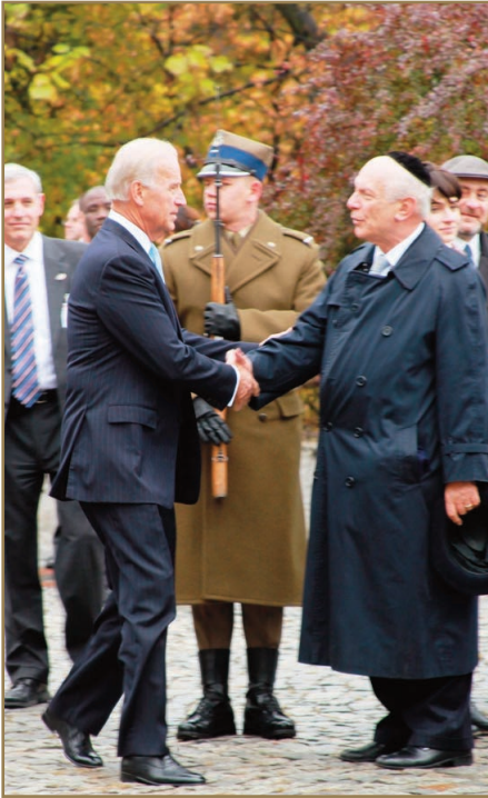
Vice President Joseph R. Biden with Rabbi Arthur Schneier at Warsaw Ghetto Memorial October 18, 2009