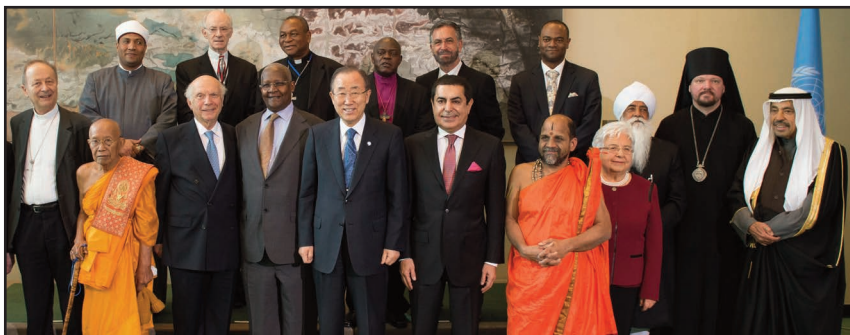
UNAOC - Promoting Tolerance and Reconciliation UN Secretary-General Ban Ki-moon addressed religious leaders on April 22, 2015