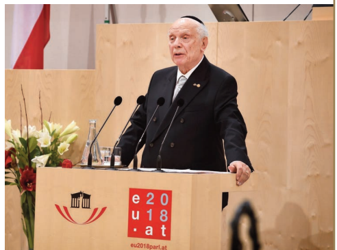
Rabbi Arthur Schneier, Vienna born Holocaust Survivor, delivers the keynote address in the Austrian Parliament commemorating the 80th Anniversary of Kristallnacht, November 9, 2018.