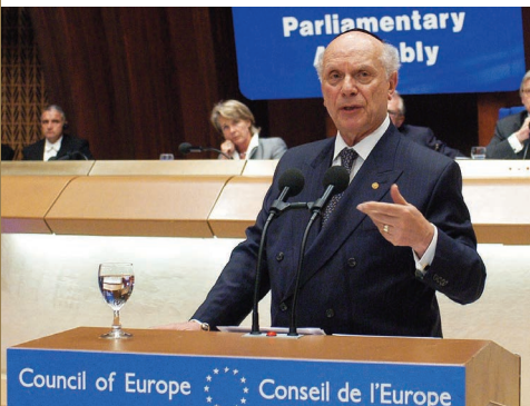
Strasbourg 2007: Parliamentary Assembly of the Council of Europe - Rabbi Arthur Schneier warns about the rise of xenophobia and anti-semitism in Europe, pleads for peaceful coexistence and mutual respect and acceptance.