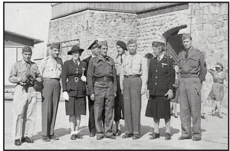
French officers who have come to inspect the Mauthausen concentration camp after it was liberated by the US Army.