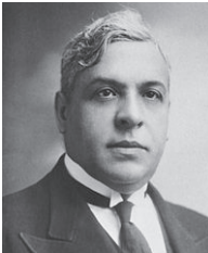
Aristides de Sousa Mendes

Rescue of 5,558 Jews during the Holocaust by issuing transit visas to them so that they could travel through Japanese territory, risking his job and his family's lives.