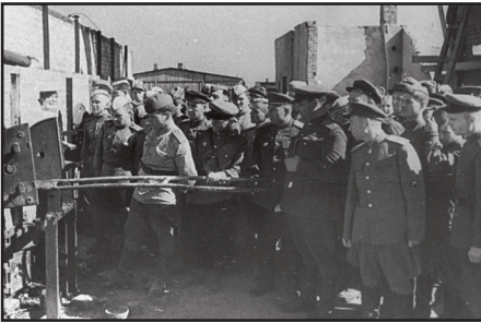
Soviet troops inspect the crematoria at the Majdanek concentration camp after the liberation.