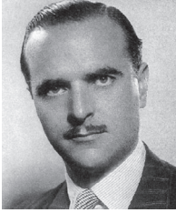
Angel Sanz Briz

His humanitarian intervention helped save Jews during the height of Nazi and Hungarian Arrow Cross oppression.