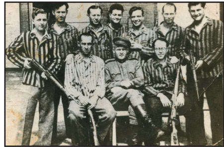
Group portrait of a Soviet soldier and liberated prisoners, some holding weapons, in the Buchenwald concentration camp.