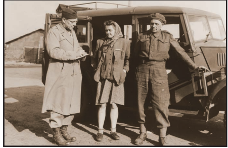
A young female concentration camp survivor is interviewed by a British relief officer while standing in front of a military jeep in Bergen-Belsen.