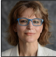
Dr. Agnès Callamard @AgnesCallamard Director, Global Freedom of Expression & Information; Special Adviser to the President, Columbia University

Dr. Agnès Callamard is the Director of Columbia University Global Freedom of Expression & Information, an initiative seeking to advance understanding on freedom of expression global norms. She spent nine years as the Executive Director of ARTICLE 19, the international human rights organization promoting and defending freedom of expression and access to information globally. She founded and led HAP International (the Humanitarian Accountability Partnership), which is the first self-regulatory body for humanitarian agencies at the international level. Prior to this, Dr. Callamard was Chef de Cabinet for the Secretary General of Amnesty International (AI) and AI's Research-Policy Coordinator, leading AI's policy work and research on women's human rights. She has advised senior levels of multilateral organizations and governments around the world and has led human rights investigations in more than 30 countries. She has published broadly in the field of human rights, women's rights, refugee movements and accountability and holds a PhD in Political Science from the New School for Social Research in New York.