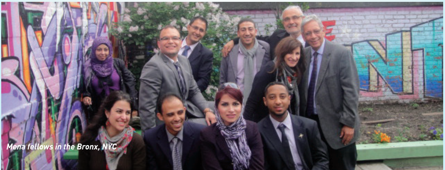
Mena fellows in the Bronx, NYC