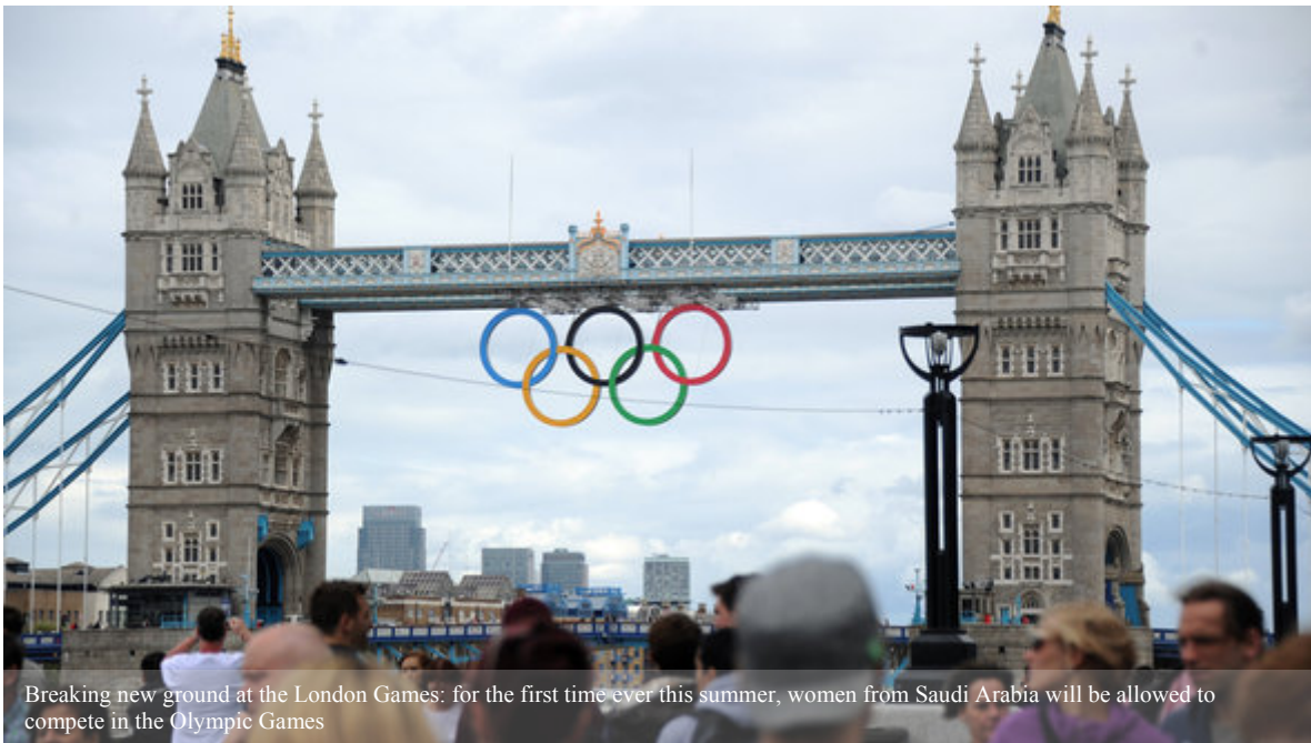
Breaking new ground at the London Games: for the first time ever this summer, women from Saudi Arabia will be allowed to compete in the Olympic Games