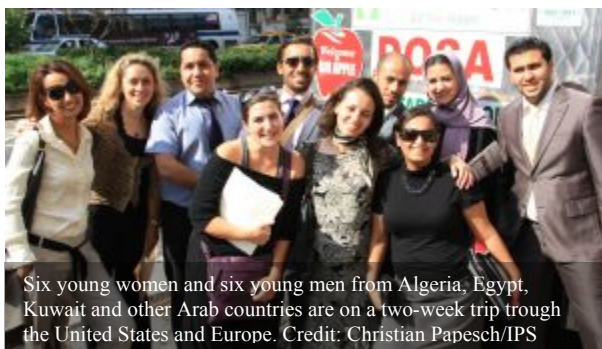
Six young women and six young men from Algeria, Egypt, Kuwait and other Arab countries are on a two-week trip through the United States and Europe.

Exactly 10 years after the attacks on the Pentagon and World Trade Center, six young women and six young men from Algeria, Egypt, Kuwait and several other Arab countries started a two-week trip through the United States and Europe. They are part of the United Nations Alliance of Civilizations’ (UNAOC) fellowship programme that was first launched last year.