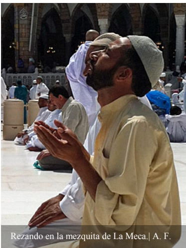
Rezando en la mezquita de La Meca. | A. F.

Los hombres del grupo, un estadounidense de origen cachemir y un francés de padres argelinos, habían logrado hacerse el día anterior en el mercado de la parte vieja de Yeda con la ropa necesaria para realizar los actos rituales islámicos de la visita a La Meca ('Umrah', como se dice en árabe) . "¿Está bien puesto?, ¿No se me caerá?", se preguntan mientras ajustaban los imperdibles. El 'uniforme' se compone de dos telas sin costuras , por lo general se usa una especie de toalla o pieza de algodón de color blanco. Las mujeres pueden ir como deseen, siempre cumpliendo con la modestia y pudor que se les presupone a los musulmanes y, eso sí, siempre con el velo islámico.