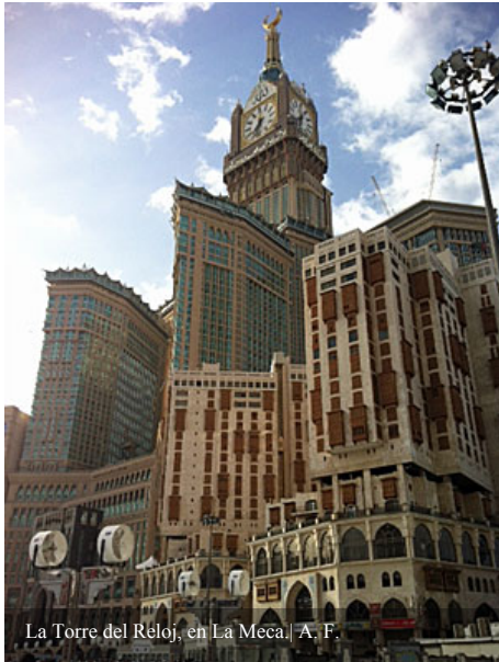
La Torre del Reloj, en La Meca.

En los últimos años, la ampliación de la mezquita así como las ostentosas construcciones circundantes han suscitado encendidas críticas. El peso de la construcción ha corrido a cargo del Saudi Binladin Group, la empresa de la familia del fallecido líder de Al Qaeda. Primero, allá por 1950, se encargaron de la extensión de la mezquita del Profeta en Medina -otra de las paradas de la peregrinación ['Haj']-; y cinco años después comenzaron con las obras en La Meca.