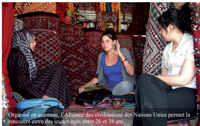
Organisé en automne, l'Alliance des civilisations des Nations Unies permet la rencontre entre des jeunes âgés entre 26 et 38 ans.

Cet automne, l'Alliance des civilisations des Nations Unies (UNAOC) lance pour la deuxième année consécutive, son Fellowship Programme , qui permet à des jeunes d'aller à la découverte de nouvelles cultures. Cette année, deux Marocains figurent sur la liste des sélectionnés. En automne, l'Alliance des civilisations des Nations Unies permet la rencontre entre des jeunes âgés entre 26 et 38 ans.