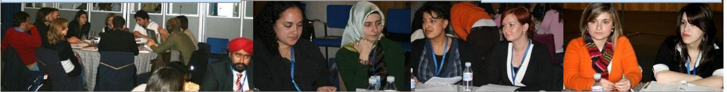
Youth participants at the Alliance of Civilizations Forum in Madrid, January 2008.

During the second half of 2008, we will also be working to develop a global online resource for youth organizations in this area that will offer materials, links, downloads and interactive spaces.