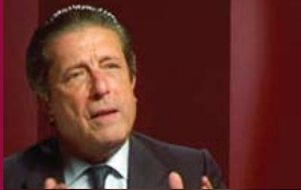
Professor Federico Mayor Zaragoza President, Culture of Peace Foundation SPAIN