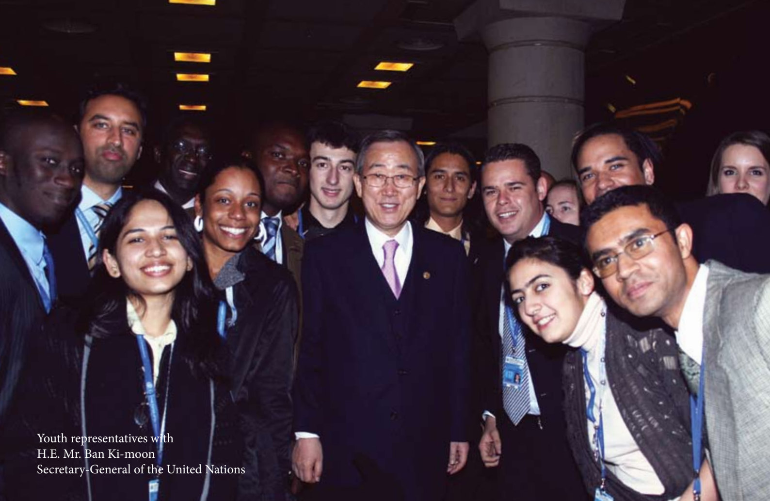
Youth representatives with H.E. Mr. Ban Ki-moon Secretary-General of the United Nations