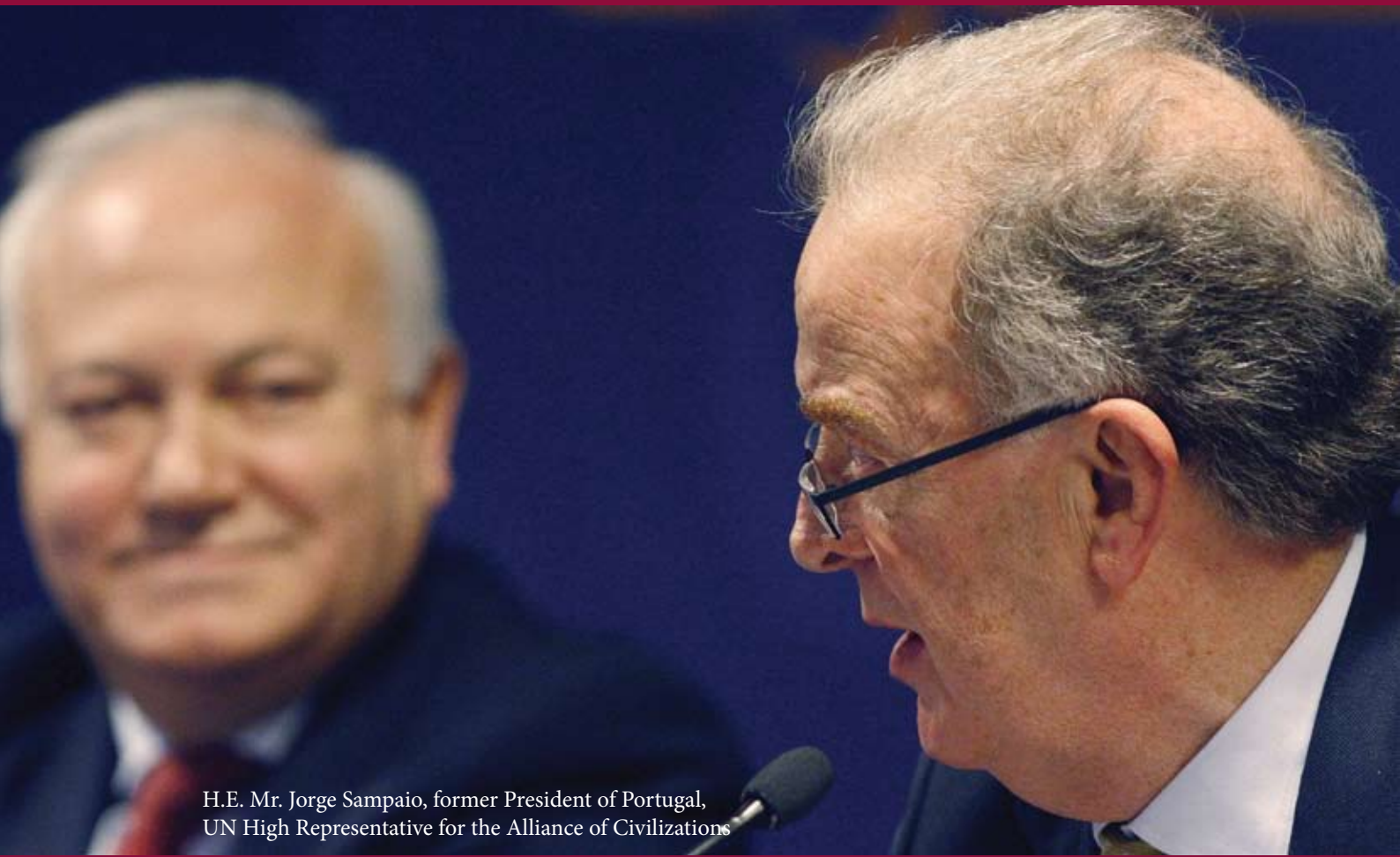
H.E. Mr. Jorge Sampaio, former President of Portugal, UN High Representative for the Alliance of Civilizations