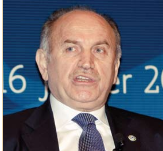
Mr. Kadir Topbaş, Mayor of Istanbul

During the session, mayors questioned the supreme role of national governments and their potential to bring about tangible improvements to people’s lives. They agreed that states alone cannot generate change. Rather, we need to look at the positive role that civil society and local authorities can play. Local schools where children are taught about the need for tolerance and understanding, and local youth clubs where they learn about other cultures are both prime examples of instruments of mobilization. Involving a few dedicated individuals within a certain community could have a very empowering and positively transforming