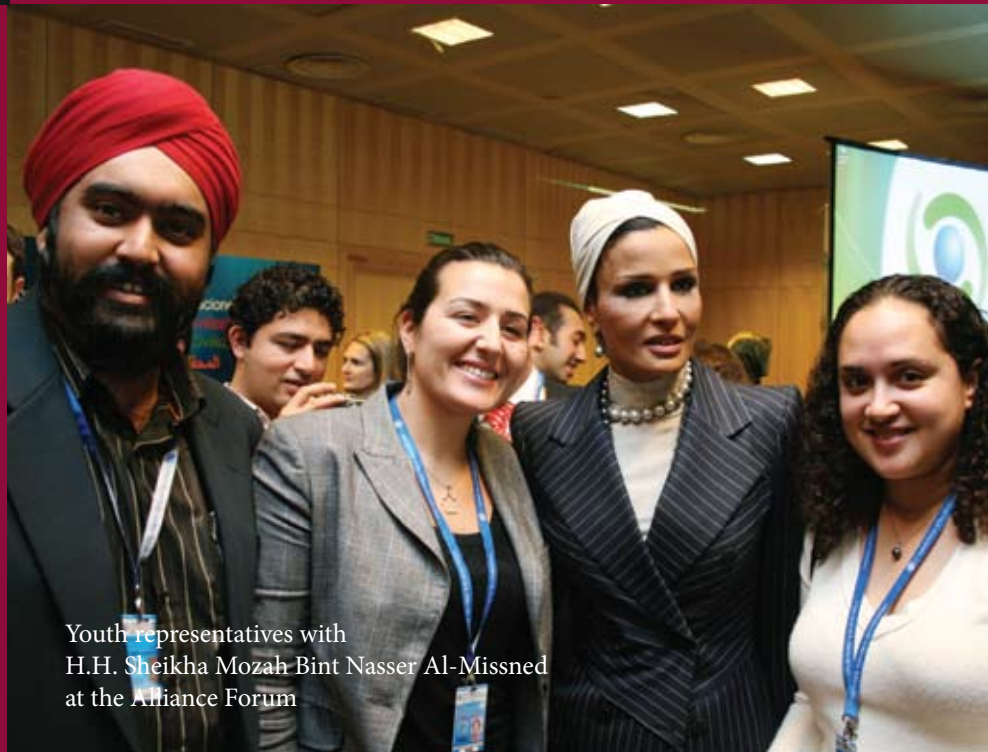
Youth representatives with H.H. Sheikha Mozah Bint Nasser Al-Missned at the Alliance Forum