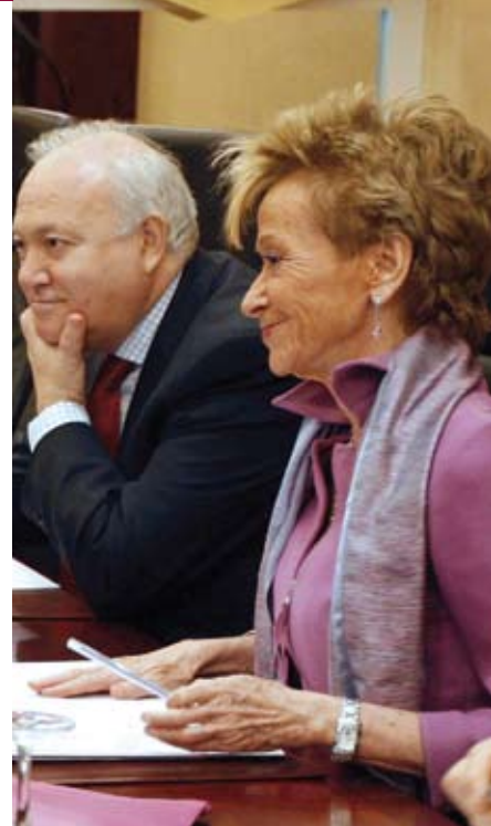
H.E. Mr. Miguel Angel Moratinos, Minister of Foreign Affairs of Spain and H.E. Ms. Maria Teresa Fernández, First Vice President of Spain