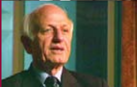
Mr. Dr. André Azoulay Adviser to His Majesty King Mohammed VI of Morocco MOROCCO