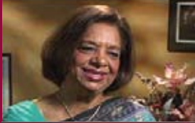
Dr. Nafis Sadik Special Advisor to the UN Secretary-General & Special Envoy of the Secretary-General for HIV/AIDS in Asia and the Pacific PAKISTAN