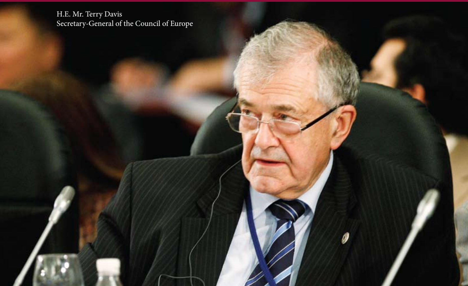
H.E. Mr. Terry Davis Secretary-General of the Council of Europe