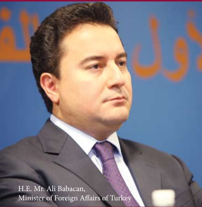
H.E. Mr. Ali Babacan, Minister of Foreign Affairs of Turkey