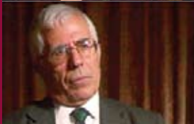
H.E. Professor Mehmet Aydin Minister of State TURKEY