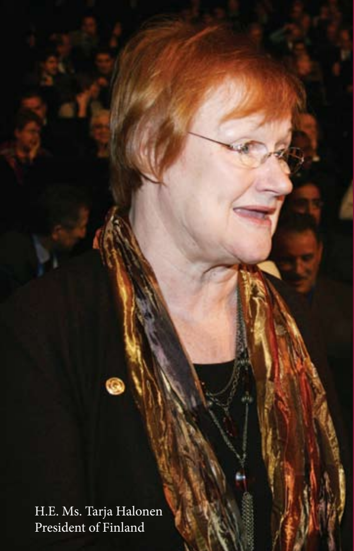
H.E. Ms. Tarja Halonen President of Finland