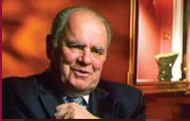
Mr. Enrique Iglesias Secretary-General, Ibero-American Secretariat URUGUAY