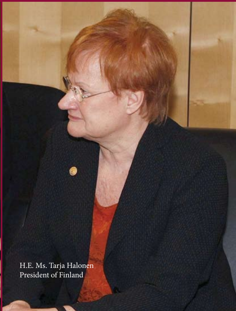
H.E. Ms. Tarja Halonen President of Finland