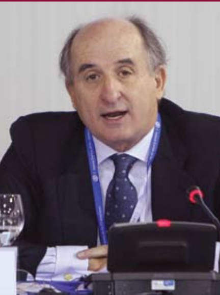
Mr. Antonio Brufau CEO, Repsol

great need for social stability. Investing in local programs and human resources in these countries would benefit the local community, the country as well as the corporate sector.