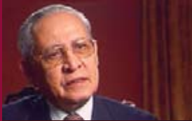
H.E. Mr. Ali Alatas Former Minister of Foreign Affairs INDONESIA