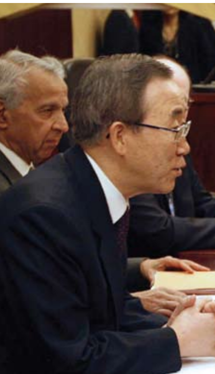
H.E. Mr. Ban Ki-moon, UN Secretary-General

Others underlined the important role of cultural programs in promoting economic development. Such programs enjoy high rates of return and can help generate employment opportunities as well as economic benefits.