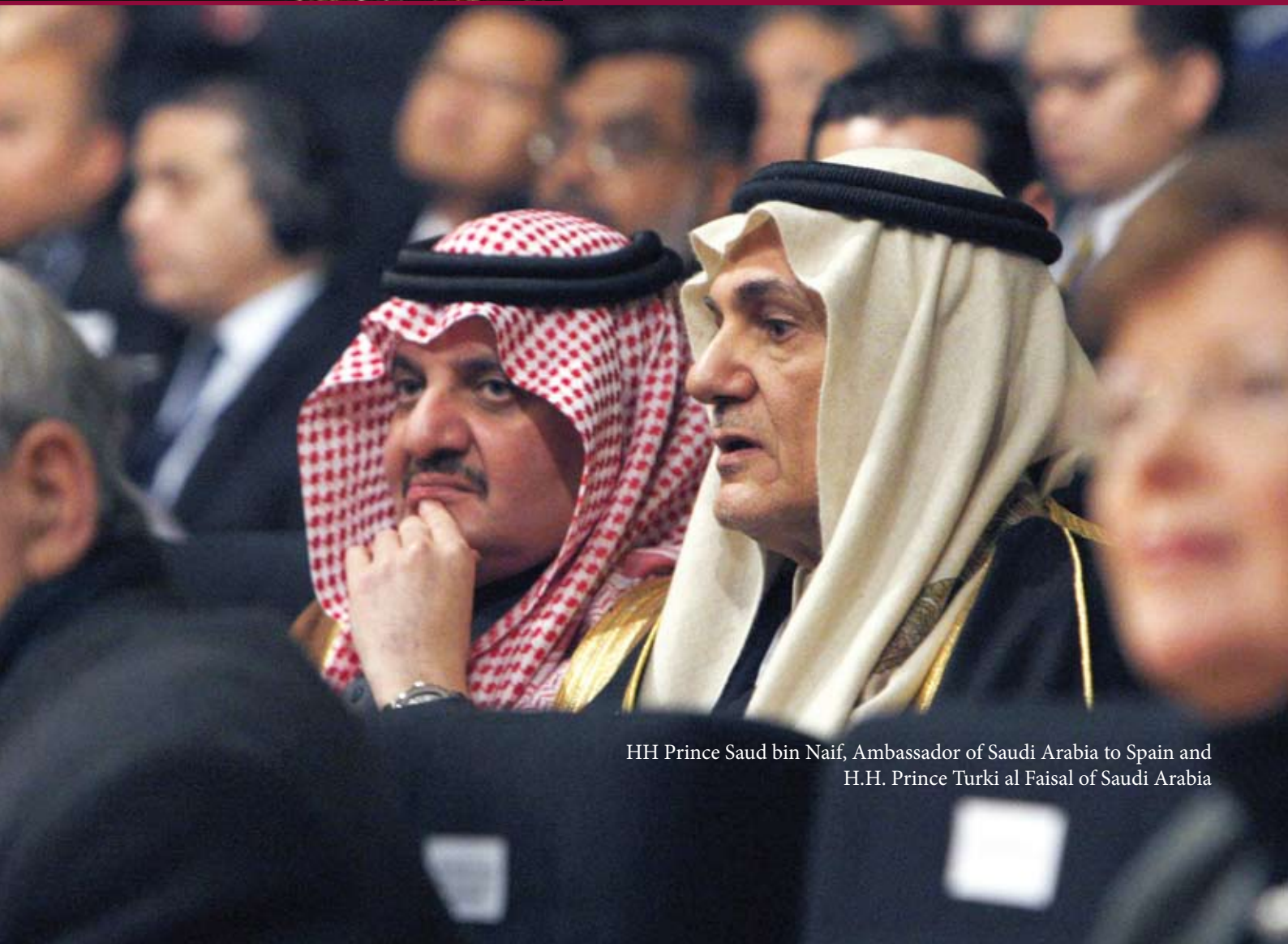
HH Prince Saud bin Naif, Ambassador of Saudi Arabia to Spain and H.H. Prince Turki al Faisal of Saudi Arabia