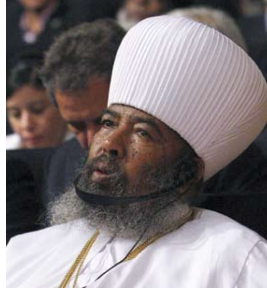
His Holiness Abune Paulos Patriarch of the Ethiopian Orthodox Church

The vast majority of people are not aware that religious leaders assemble in this way. It is important to raise the profile and visibility of exchanges such as this one. But the issue at hand is more than a matter of public relations. The misperception that religion is the root cause of violence needs to be dispelled. Engaging voices that represent the peaceful, mainstream of religions is essential, as ignoring them allows extremists to fill the void left by their absence. Thus, religious leaders have a necessary role in the promotion of shared security. In that respect, it was suggested that a future theme for the AoC Clearing-house should be the collection of best practices in the engagement by religious leaders and communities of other key sectors, including the corporate, political, and media sectors for the purposes of advancing development, humanitarian action, and positive social change.