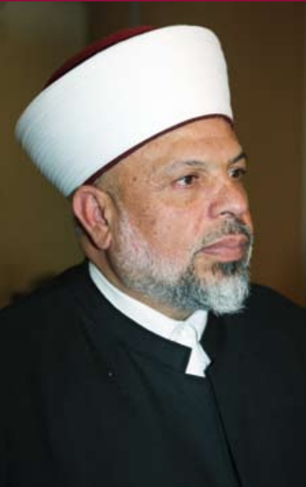
H.H. Sheikh Tayseer Al-Tamimi of Palestine

Participants also recognized that to expand shared security, disparities in income, allocation of resources, and various other inequities also need to be addressed. The dynamics of globalization have further cemented many of these problems. Shared security cannot be achieved without working toward global justice. Engagement from multiple sectors and stakeholders is thus necessary to make progress.