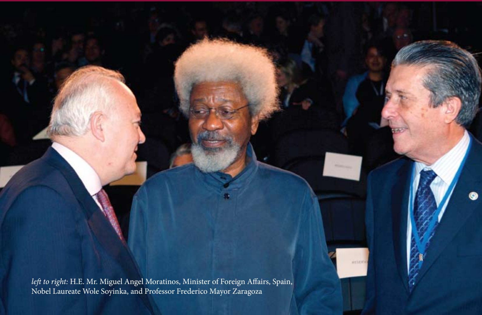
left to right: H.E. Mr. Miguel Angel Moratinos, Minister of Foreign Affairs, Spain, Nobel Laureate Wole Soyinka, and Professor Federico Mayor Zaragoza