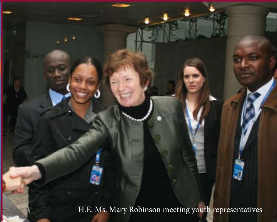
H.E. Ms. Mary Robinson meeting youth representatives