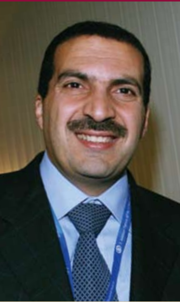
Mr. Amr Khaled Broadcaster

ceptions of minorities are deeply affected by media images portraying acts of violence committed against the group they identify with. The aim of the AoC Media Fund is to support productions that promote positive images of minorities and to provide platforms for their widespread dissemination. It was noted that the AoC Media Fund was a non-profit venture and that income generated by Fund-supported productions would be reinvested into the Fund.