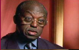
H.E. Mr. Moustapha Niasse Former Prime Minister of Senegal SENEGAL