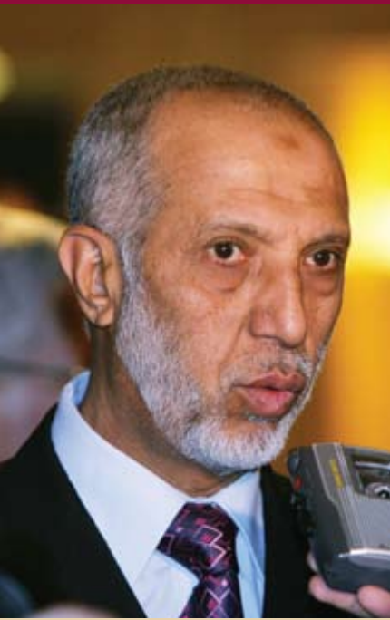
H.E. Mr. Abdelaziz Belkhadem Prime Minister of Algeria

Others focused less on the fostering of cooperation than on the necessity of renewed political will, particularly in the West. Dr. Gareth Evans argued that the U.S. must elect leadership that will evenhandedly try to solve problems and advance the Middle East peace process and that the EU should recognize and embrace the potential of Turkey, while bringing more of its political and economic power to bear on advancing the Middle East peace process. He added that the “clash paradigm” had reinforced an unwillingness to place the requisite political will behind solving key conflicts, particularly in the Middle East. More than anything else, it has increasingly polarized people: