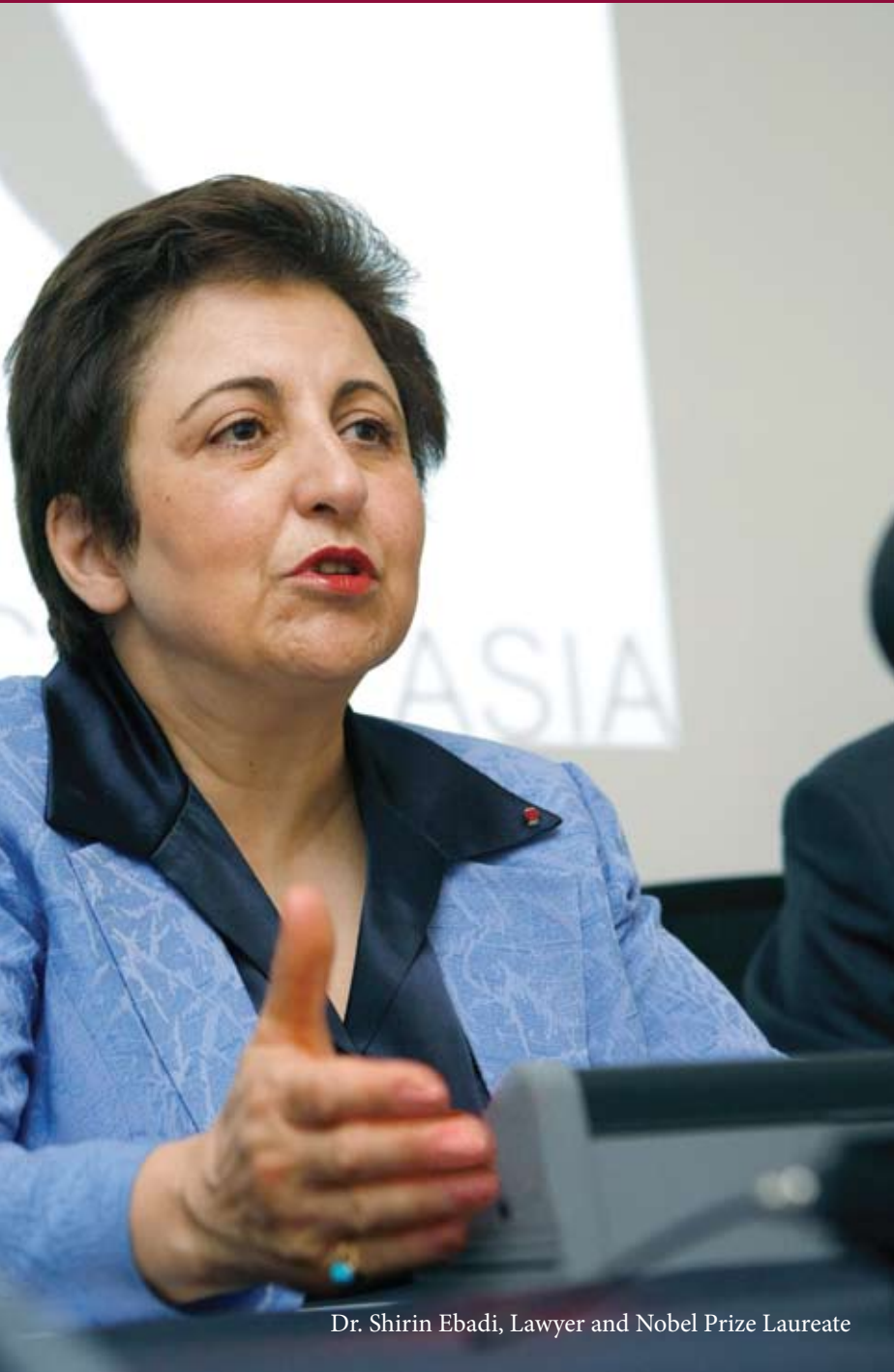
Dr. Shirin Ebadi, Lawyer and Nobel Prize Laureate