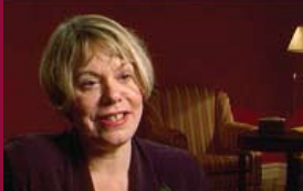
Ms. Karen Armstrong Author and Theologian UNITED KINGDOM